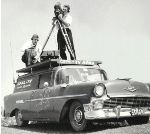
1956 Chevrolet CFPL News Cruiser

5. 9 Steps for Financial Freedom with Suze Orman. 4. Les Miserables. 3. Suze Orman: Courage to Be Rich. 2. 3 Tenors -- Los Angeles. 1. Doo Wop 50... CFPL-TV London , now CHUM's The New PL , celebrated its 50 th anniversary last Friday. It aired a two-hour documentary called Rewind: 50 Years of Local Television on The New PL . CFPL-TV was Canada's second private TV station when it went to air Nov. 28, 1953.