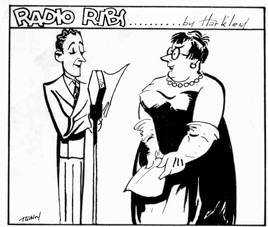
And now, tripping daintily to the microphone, comes our glamorous Lady of the Dawn. In a moment she will pour forth a little of her exotic self in sweet song—it says here.

Our next issue will go in the mail February 12, and will also be distributed to CAB members at the opening of the annual meeting in Quebec. News items for this issue should reach us no later than February 1st.