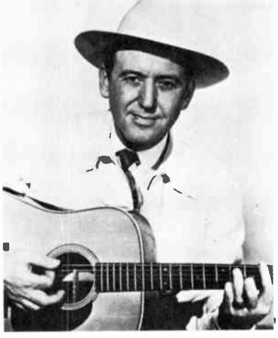
Red Foley played with the Cumberland Ridge Runners and performed as Burrhead, the bashful beau of Lulu Belle, early in the 1930's. He returned to the Barn Dance in 1940.