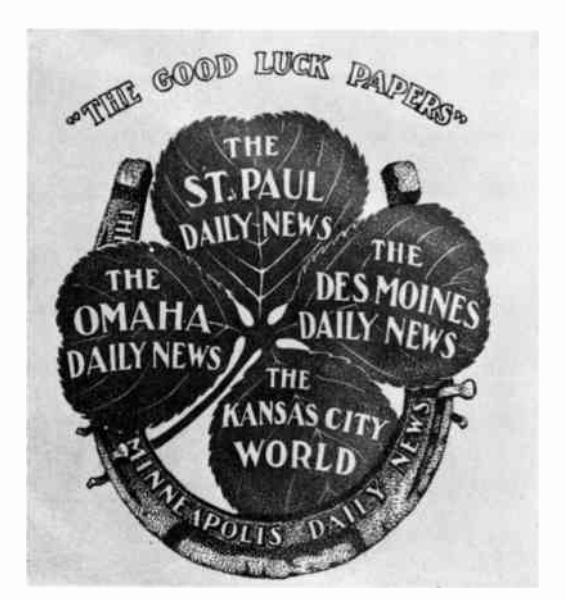
Emblem of Clover Leaf Newspapers in 1905. The emblem became unwieldy as the chain embellished it to accommodate as many as 10 papers in 1914.