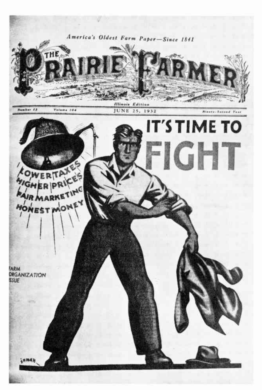
This spirited call for action reflects the temper of depression-ridden farmers in 1932. Under Clifford Gregory, Prairie Farmer urged farmers to unite in support of cooperatives and farm legislation.