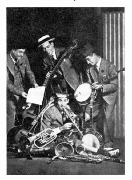
The Hoosier Hot Shots produced laughs and unique musical sounds for about 13 years on the Barn Dance using their odd assortment of instruments.