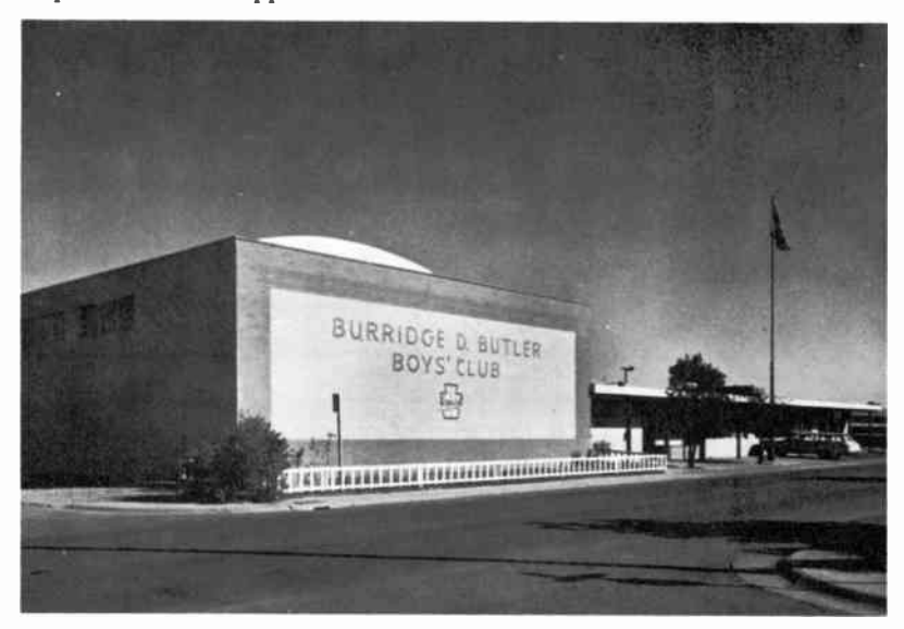
Burridge D. Butler Boys' Club of Phoenix reflects Butler's role in starting a program in that city during the 1940's. Earlier he had helped form a Boys' Club program in Chicago.