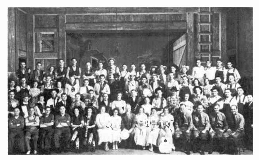
National Barn Dance performers in the Old Hayloft. Between 70 and 100 performers appeared on each program after 1933. From 1933 until 1946 the Barn Dance was sponsored nationally over NBC.