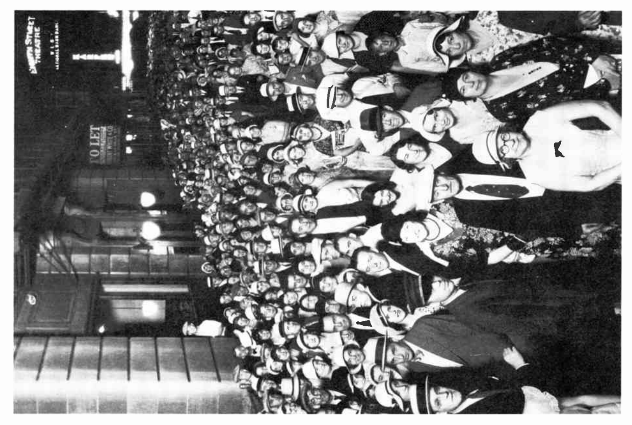
More than 2,600,000 persons paid to see the WLS National Barn Dance during its 25-year-run in the Eighth Street Theatre. Crowds filled the 1,200-seat theatre twice every Saturday night.