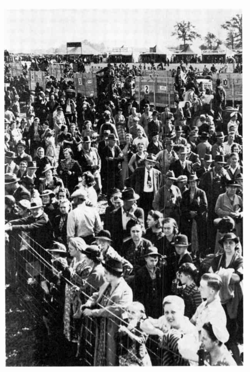
As many as 95,000 persons attended Illinois State Corn Husking Contests sponsored annually by Prairie Farmer between 1924 and 1941. The paper also sponsored state contests in Indiana and hosted several national meets.