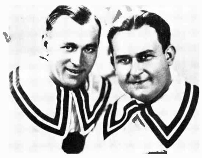
Ford and Glenn served as the Lullaby Twins on WLS soon after it began broadcasting in 1924. Their bedtime program for children featured a mythical Woodshed Theater.