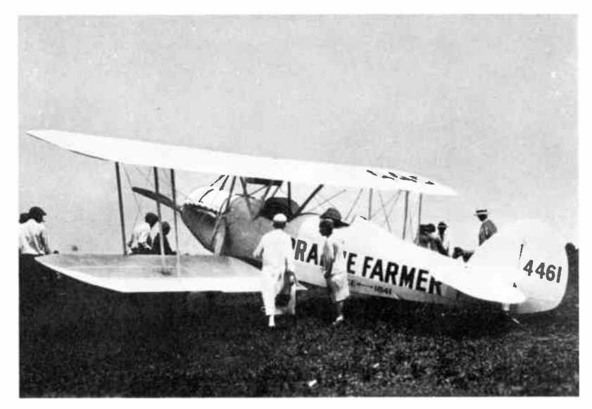
Staff members became celebrities during the summer of 1928 because of this airplane. It touched down in cow pastures of nearly every county to help the staff cover agricultural events.