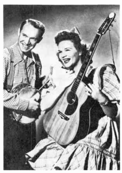
Lulu Belle and Scotty began a sweetheart routine on WLS that lasted for a quarter-century. In 1936 Lulu Belle was voted National Radio Queen.