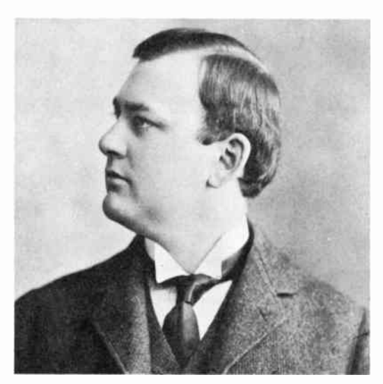
Butler as a salesman for the Scripps-McRae League of newspapers just before the turn of the century.