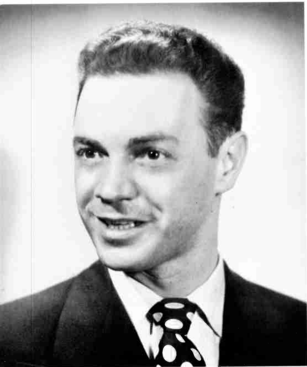
Publicity shot taken c. 1949–1950, when Freed left WAKR and joined WXEL-TV in Cleveland.