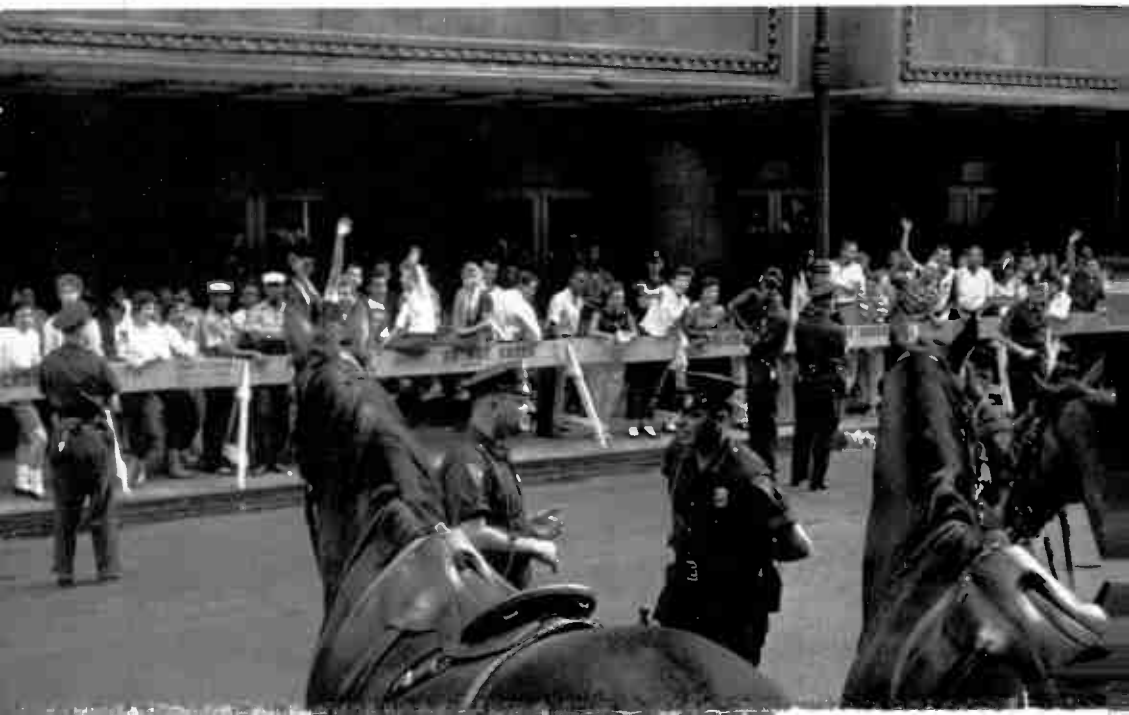
"Rock 'n' Rollers Collect Calmly," reported a surprised New York Times on July 4, 1957. Teenagers queue for Freed's "Summer Festival" at the New York Paramount.