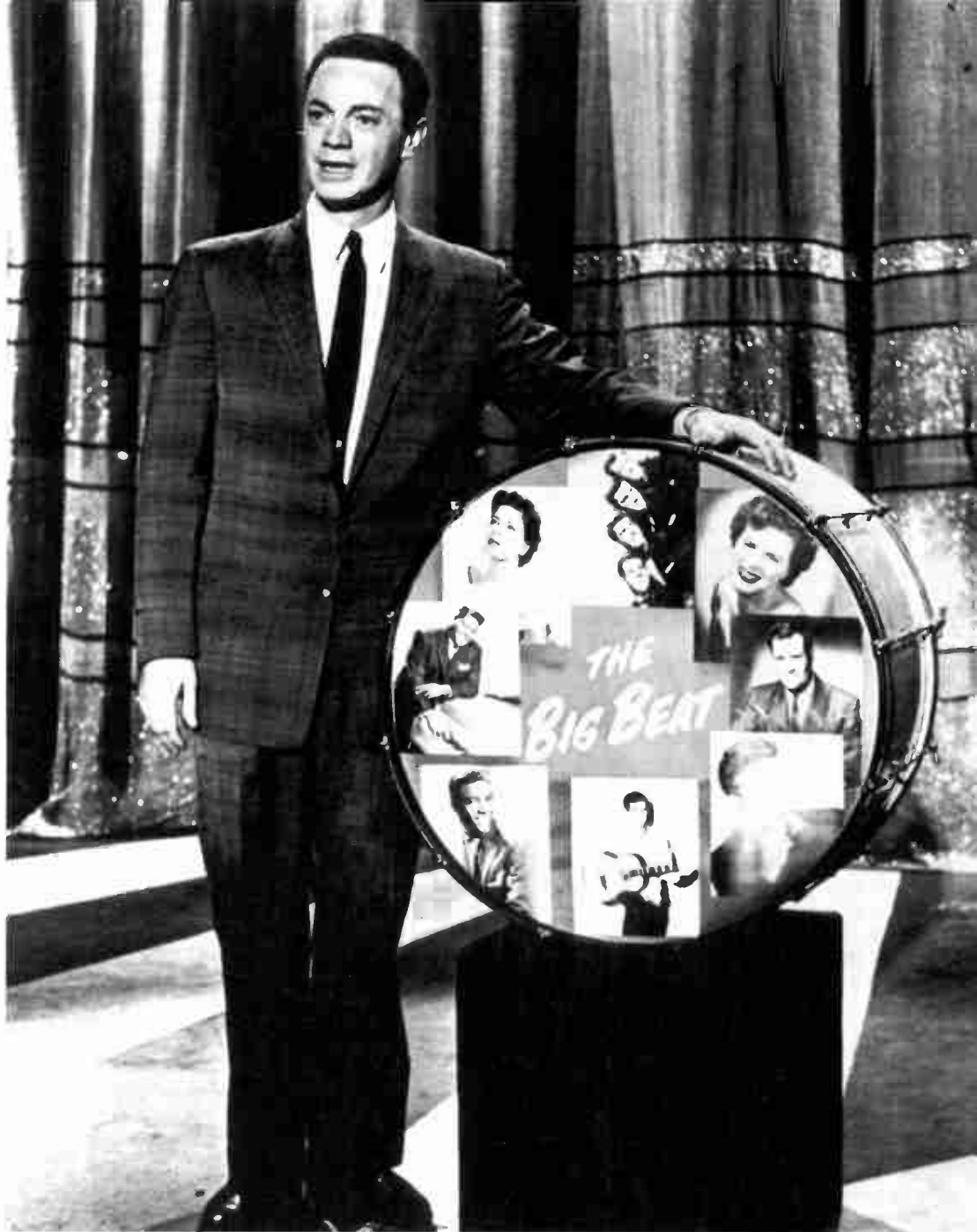
A publicity shot for Freed's third WABC-TV "Big Beat" telecast, July 26, 1957. The show starred, clockwise from top, Jimmy Bowen and the Rhythm Orchids, Patsy Cline, Marvin Rainwater, Jimmy C. Newman, Dale Hawkins, Clyde McPhatter, Fats Domino, and an unidentified female singer. On Freed's TV show the week before, Frankie Lymon danced in front of the camera with a white girl. Two weeks later, Freed's show was canceled by ABC.