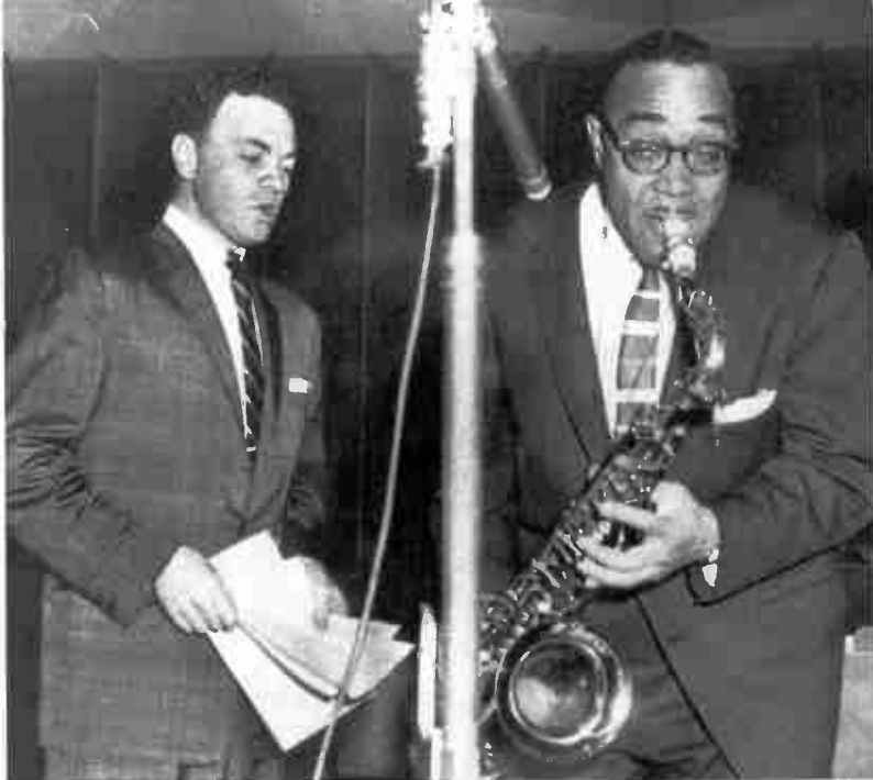
Freed with "Big Al" Sears, October 5, 1956, rehearsing for the deejay's CBS radio "Camel Rock 'n' Roll Party" the following evening.