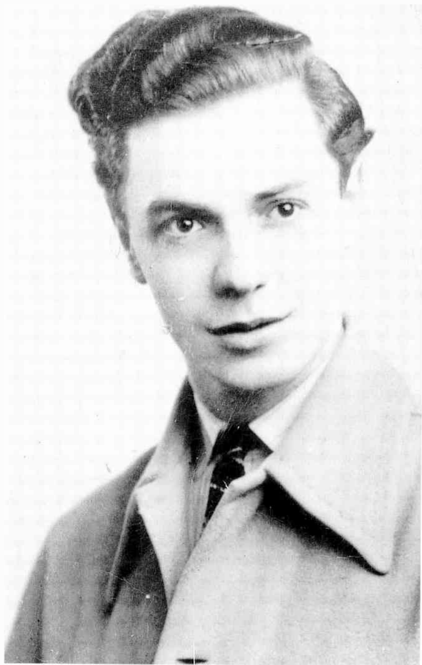
"Al J" Freed during his senior year at Salem (Ohio) High School, 1939-1940.