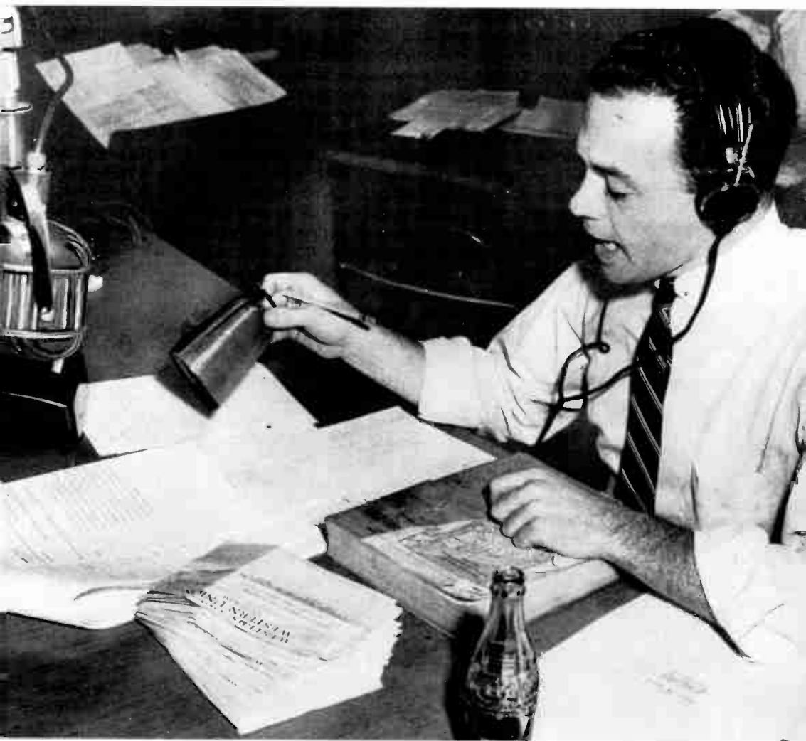
Freed with his props—cowbell, telephone book, and a stack of telegrams from his listeners—on the air, October 9, 1956.