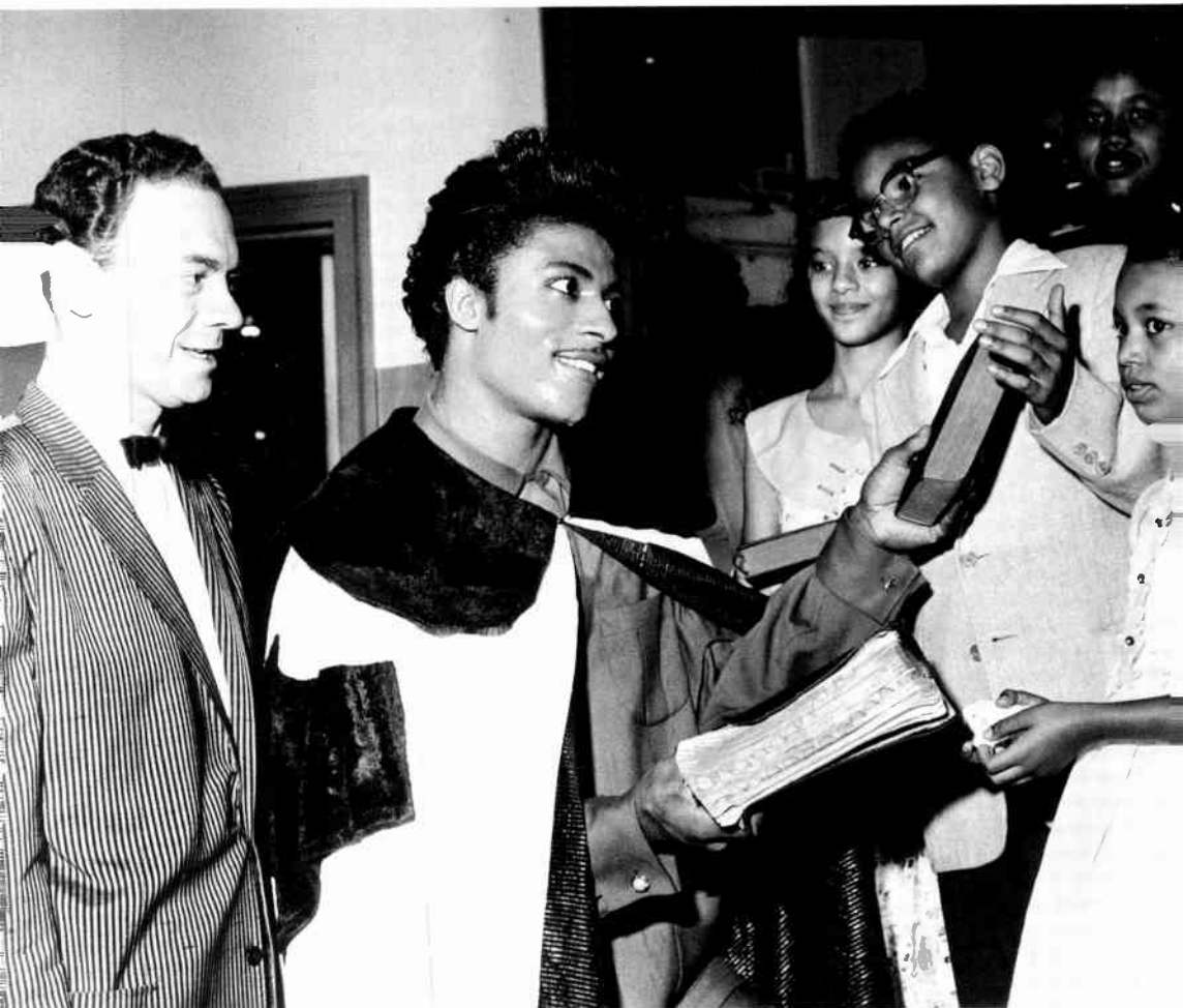
Freed and Little Richard backstage at the Brooklyn Paramount, Labor Day 1957, shortly before the release of Mister Rock and Roll , in which Richard performed "Keep-a Knockin'." Note Richard's Bible; when the singer became an ordained minister that year, his record company tried to keep it a secret from Richard's record-buying fans.