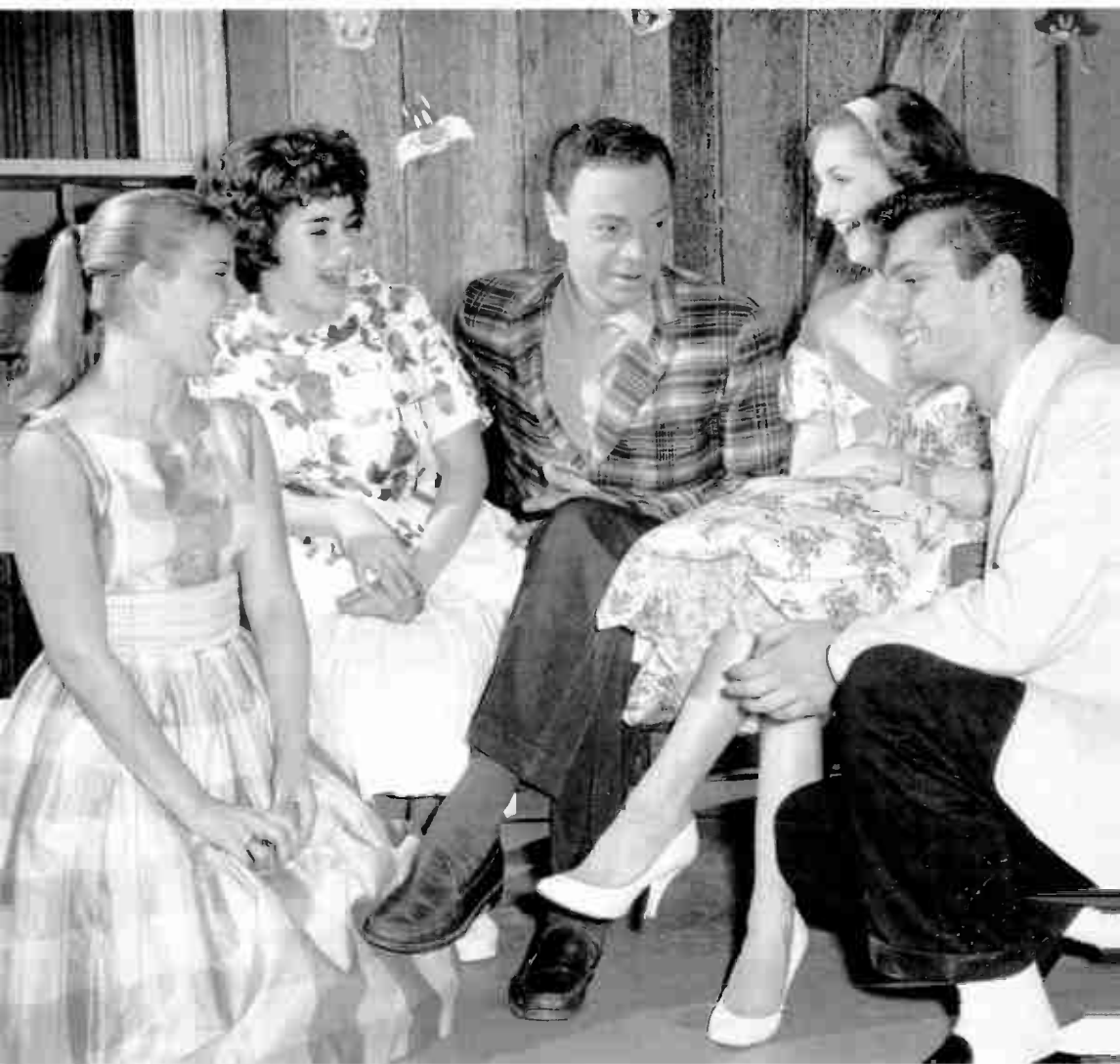
Freed, with some of that day's guests on the deejay's WNEW-TV "Big Beat" show, August 16, 1959.