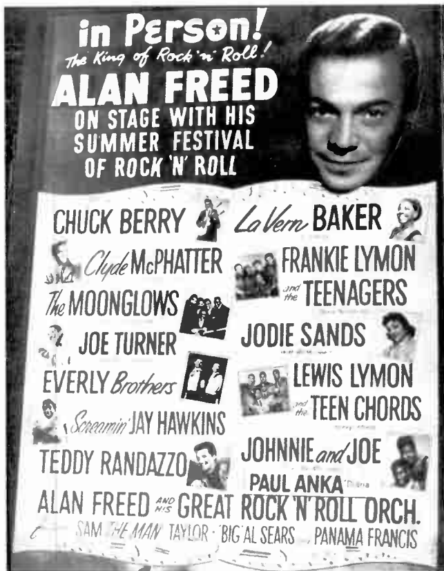
A New York Paramount billboard advertising Freed's July 1957 "Summer Festival."