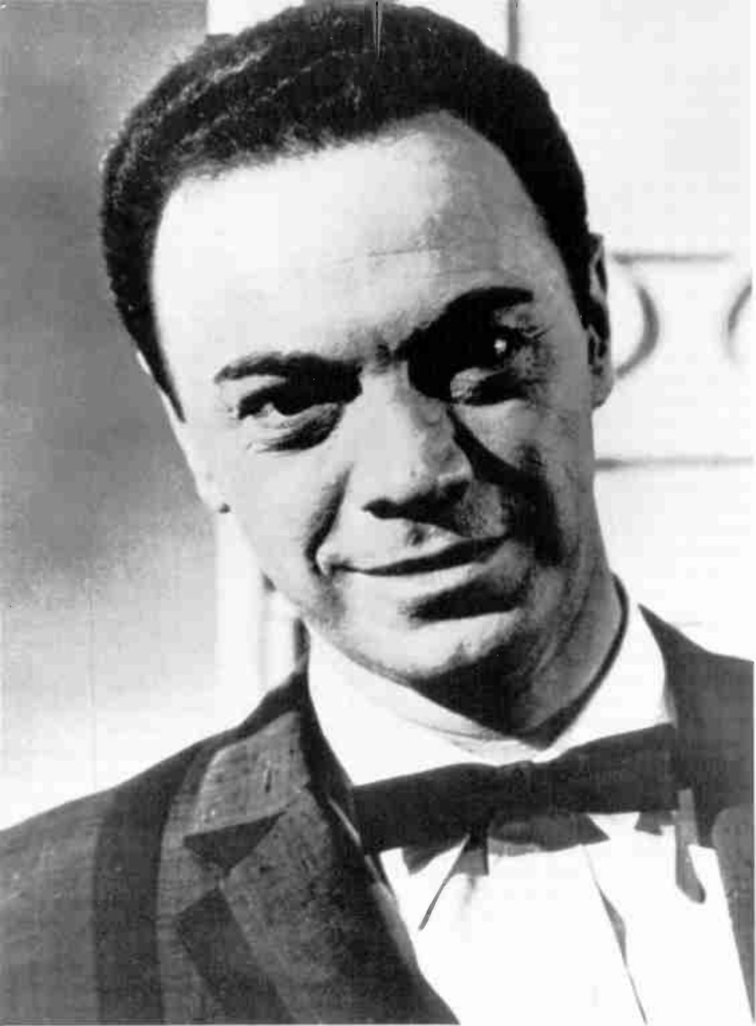
An uncommon publicity still from Freed's fourth movie, Mister Rock and Roll, which premiered in October 1957.