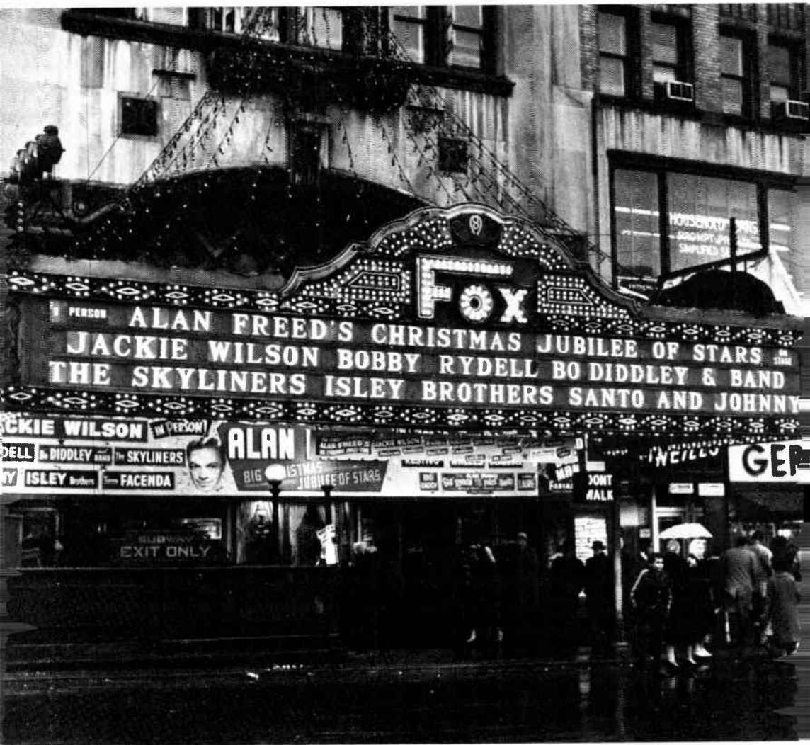
Freed's "Christmas Jubilee of Stars" at the Brooklyn Fox, held shortly after the deejay's firings from WABC Radio and WNEW-TV. Freed was to present one additional stage show in New York (at the Apollo Theatre in February 1960).