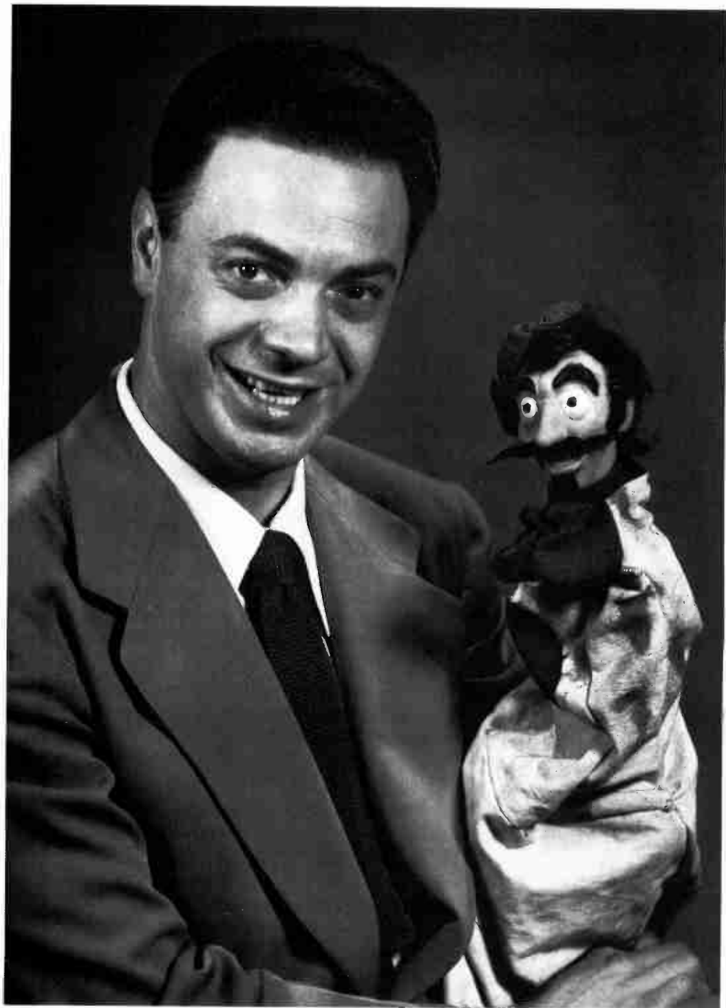
WXEL-TV publicity still of Freed with one of the props he used on his ill-fated television show, c. 1950–1951.