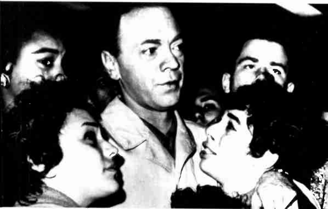
Freed, surrounded by his fans after the final telecast of his WNEW-TV "Big Beat" show, November 27, 1959.