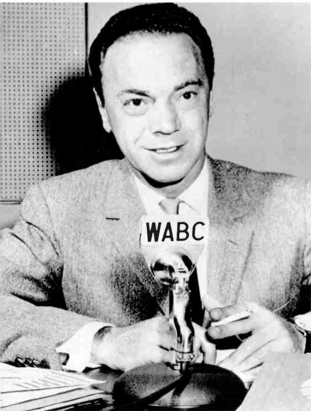
WABC publicity photo, June 1958, when Freed began broadcasting on the station.