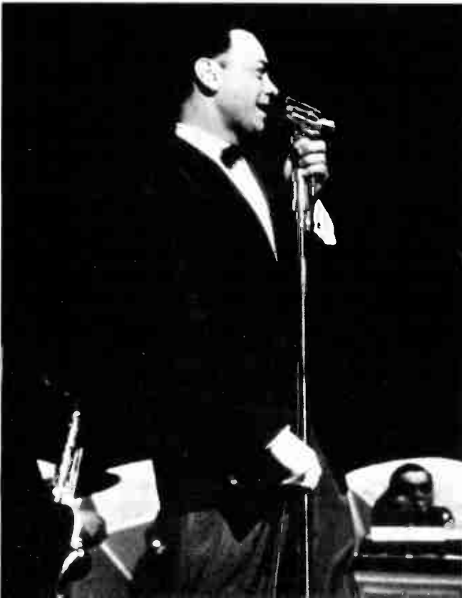
Freed on stage in 1957.