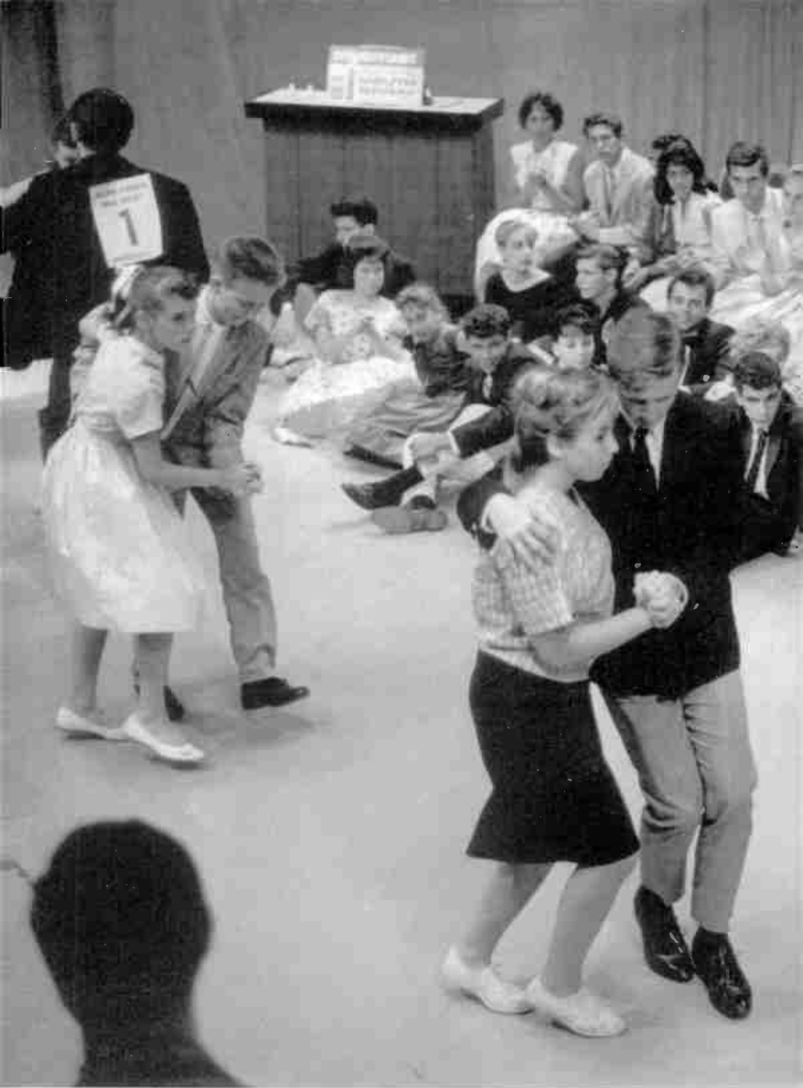
Teenagers dancing on Freed's WNEW-TV "Big Beat" show, August 16, 1959.