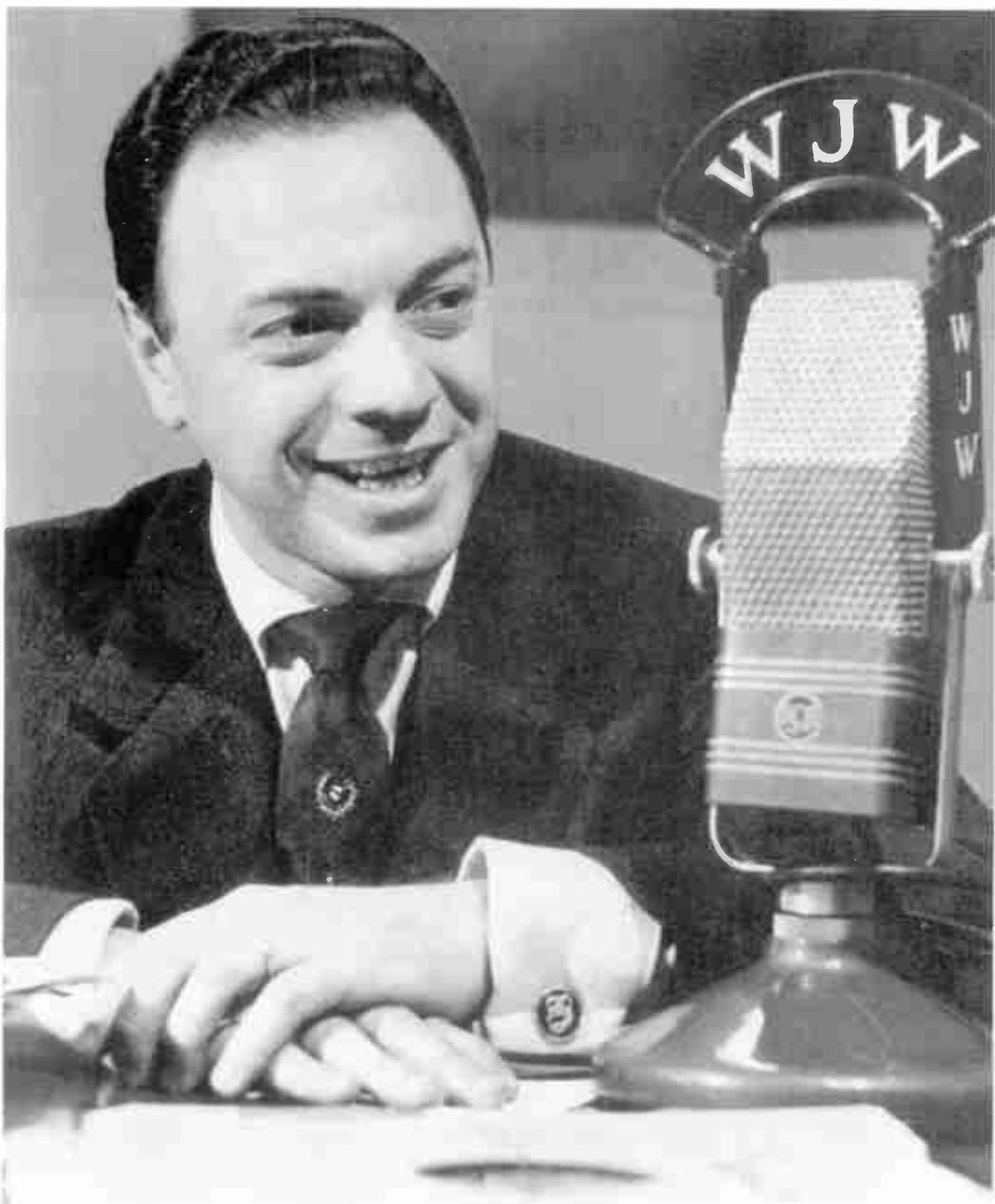
WJW publicity photo taken before Freed's automobile accident in April 1953.