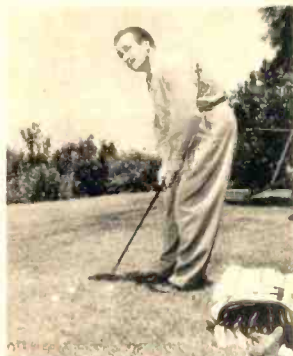
YOU COULD EXPECT A GUY NAMED GOFF TO LIKE TO PUTTER