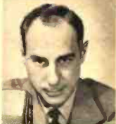
4. CHAMPION radio and newspaper sportscaster, Bill Stern, covers on-the-spot events for NBC. Is also heard each week with a complete review of the sports world on what night?