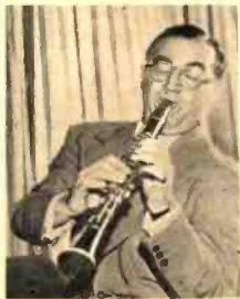
BENNY GOODMAN'S LATEST IS A MUST