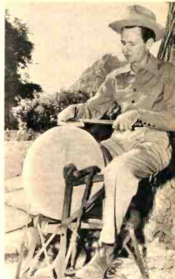
EVEN WHEN OFF THE AIR, "LUM" CAN FIND AN AX TO GRIND