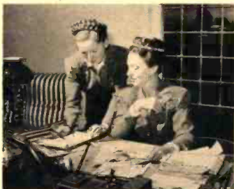
AND REMIND ME TO BUY A HAT , Agnes Moorehead, who plays the sharp-tongued Matilde on "Mayor of the Town," checks over her very busy daily schedule of activities with her private secretary.