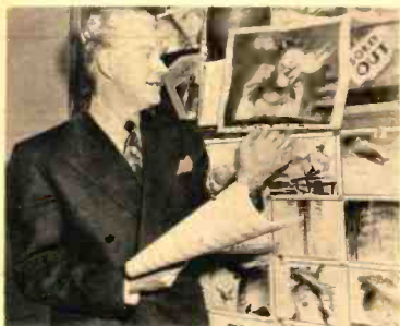
NELSON EDDY BEGGED DISNEY FOR CHANCE TO PLAY WILLIE