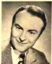
5. TRUTH OR CONSEQUENCES? You'll pick the "Truth"? Then, what's the name of this quiet-looking gentleman whose devilish stunts turn brilliant loose over the nation every Saturday on NBC?