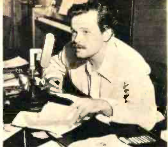
Orson Welles airs his Sunday thoughts from the privacy of his home.