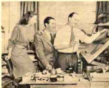
DINAH SHORE, WALT DISNEY AND ARTIST PREVUE A SKETCH