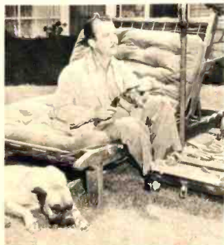
"ABNER" PRACTICES FOR DAY WHEN HE CAN GET A LINE WET