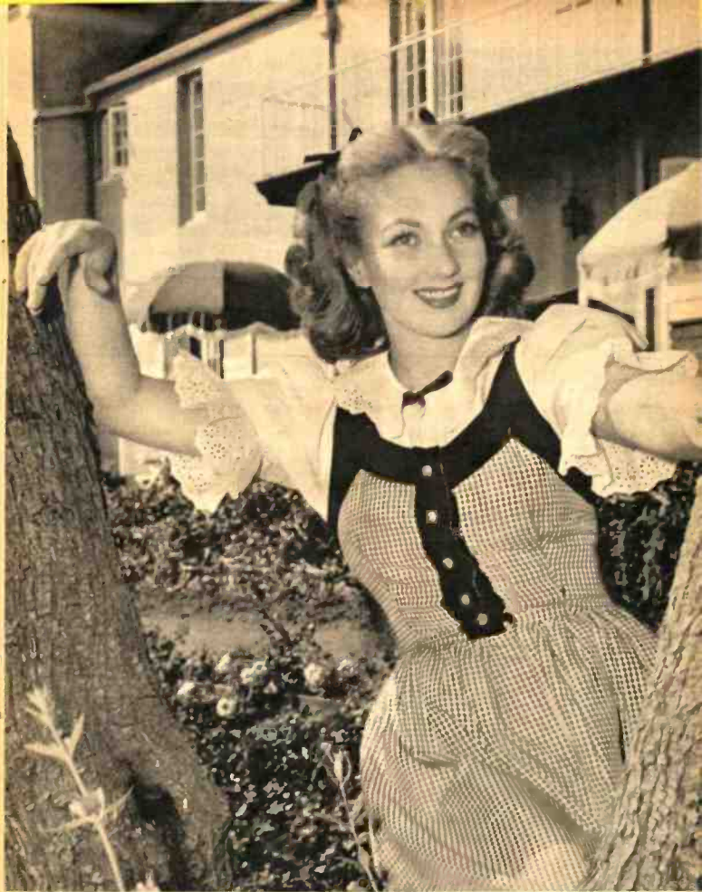
MAKING LIKE MAISIE: Even in her own back yard Ann finds it hard not to behave like Maisie for she doesn't like to let her fans down. Thus she frets for the cameraman. Ann really prefers simple clothes and loves fishing, which Maisie hates. Oh, well . . . Maisie pays the bills.