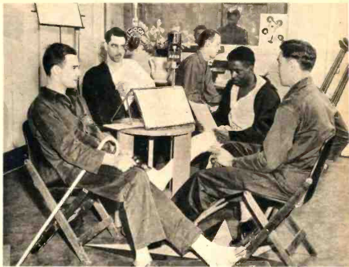
NETWORK ALSO GIVES SERVICEMEN A CHANCE TO AIR VIEWS IN PROGRAMS LIKE "G. I. ROUND TABLE" FROM NEW YORK HOSPITAL

Rome, at airfields at Casablanca or in submarines under the China Sea, servicemen have come to call these programs their own and it's old home week every day when they hear 'em once again in Stateside hospitals.