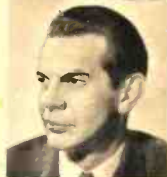
1. RAYMOND MASSEY , famed for his movie portrayal of Abraham Lincoln, now plays many roles as the "harvester" of NBC's hit dramatic-musical show, heard on Sundays. What's the harvest?

Fall's in the air—and with fall, the Greatest Shows in Radio are on NBC's air for another season as veteran favorites rub shoulders with exciting new programs. If you don't know the answers in this brief quiz, that means you're missing your best listening bet—for the answers are all part of the NBC Parade of Stars, the year-around cavalcade of the best listening on the air.