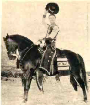
"DRESS PARADE" AS HE MOUNTS HIS HORSE OF SAME NAME