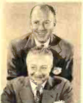
6. "AW-WAH, AW-WAH!" cries one of this famous team, who've been on NBC over 18 years. You'll hear "Amos 'n' Andy" again Tuesday nights starting in October. Know their real names?