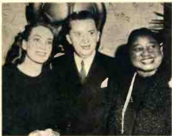
MAKING LIKE A TOOTHPASTE AD are stars Joan Crawford, Jean Hersholt, Hattie McDaniel. It must have been some birdie is all we can say. The occasion was a CBS cocktail party.