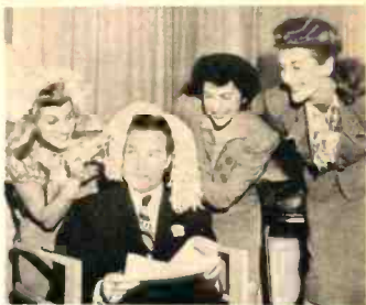
CALL ME MOPSY! The Andrews Sisters decide to turn their trio into a girls' quartet by embellishing Bob Hope with a mop of hair.

The recording, released over a transcribed network during June, saw Hope headlining an hour-long comic field day which included the talents of the Andrews Sisters, Frank Morgan, Vera Vague, Ginny Simms, Eddy Duchin, Dennis Day, Harry Von Zell, Rochester, and Ray Noble and his band.