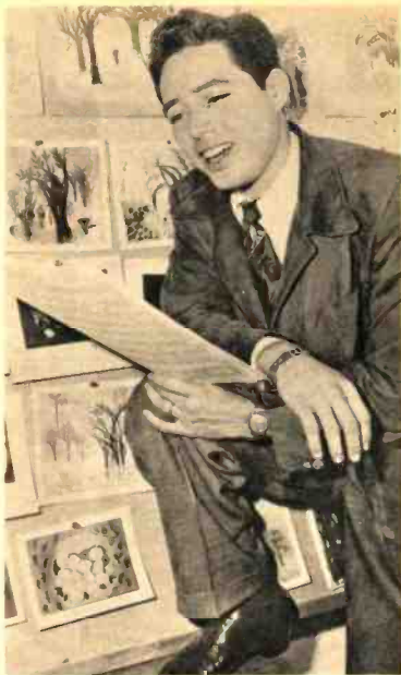
ANDY RUSSELL WHO IS LATIN-BORN CROONS A SPANISH TUNE

B EHIND the mad musical caperings in Walt Disney's brilliant new film are the voices of many leading luminaries of radio. For each one Disney selected a role that personified something they had always wanted to be or do. Jerry Colonna, a red-hot baseball fan, is right in his element as Casey at the Bat. The Andrews sisters have always wanted to do a romantic role and here they sing the love story of Johnny Fedora and Alice Blue Bonnet. Long-time Disney fan Nelson Eddy was so enamoured of the tragi-comedy role of Willie The Whale he practically begged Disney for the part. Dinah Shore, who adds vocal luster to the ballet sequence, has cherished a childhood dream of being a ballerina. And Andy Russell, who sings the Spanish tune "Without You," is Latin by birth and temperament.