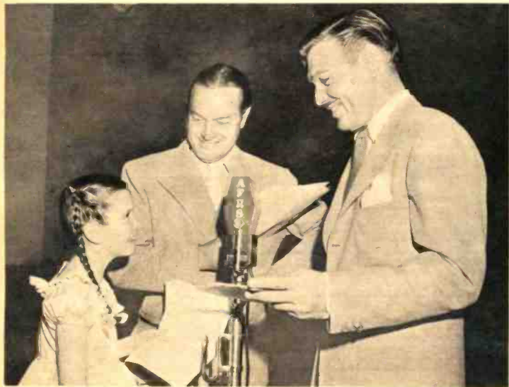
"COMMAND PERFORMANCE" PROVIDES STARS LIKE MARGARET O'BRIEN, BOB HOPE AND CLARK GABLE FOR THE HOSPITAL CIRCUIT

Programs such as "Command Performance," "Mail Call" and "G. I. Journal" are old acquaintances of many servicemen and dischargees. For three years, from Guadalcanal to