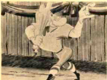
FOR THE FIRST TIME "CASEY AT THE BAT" IS SET TO MUSIC