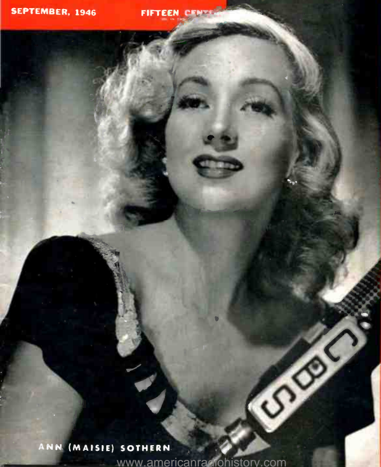
ANN (MAISIE) SOTHERN