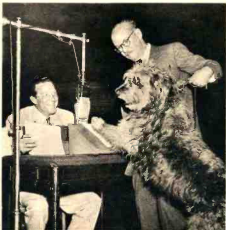
B0ULTON HAD TROUBLE PERSUADING "GOOFY," TALKING WAR CANINE HERO, TO PERFORM