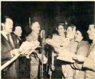
GRAND FINALE! Hope leads Ginny Simms, Frank Morgan, the Andrews Sisters and Dennis Day in his theme song, "Thanks for the Memory."