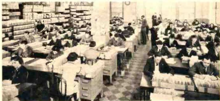
THE CONTEST JUDGING IS SYSTEMATIZED AT DONNELLEY'S — THE PRIMARY READERS GIVE ENTRIES THEIR FIRST CHECKING

If your letter survives the junior judges, it then goes to the senior judges, who give it a more severe screening and attach an actual rating, scored point by point. The