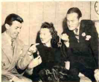
SURPRISE BABY SHOWER for expecting Ginny Simms followed the broadcast, Dennis Day and Bob Hope contributed toys and rattles.