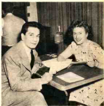
JERSEY CITY, N. J.—Actor Richard Conte speaks his mind on teenagers to Dolores Gray and her WHOM "Highlight Special" listeners. Program, a Hollywood chatter music-show, is slanted for bobby soxers.