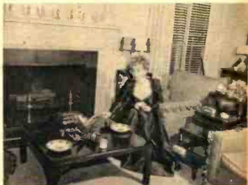
A LADY AT HOME: Ann's charming Beverly Hills home reflects a very good taste. Maisie would prefer something more flamboyant.

There's one person, however, to whom Maisie's harum-scarum, impulsively shrewd ways are often a great trial. And that's her progenitor, Ann Sothorn. Ann has become so thoroughly identified with the radio and screen role she created that she often finds it hard to remember just who she is. As a matter of fact, she is neither Ann nor Maisie; she was born Harriet Lake of North Dakota and as such was discovered and given a Broadway start by Florenz Ziegfeld. But Maisie fans expect Ann (nee Harriet) to be and act like Maisie and sometimes that makes things difficult, as the two have quite different tastes. Maisie loves to get herself up in frill and furbelows. Ann prefers simple clothes. Maisie doesn't go in for sports; Ann adores fishing. Nevertheless, Ann admits that the little Brooklyn gal with the heart-of-gold and the will-to-spurn diamonds has done all right by her. Fans think Maisie has done all right by them, too, according to their letters, which add up to "Long Live Maisie!"