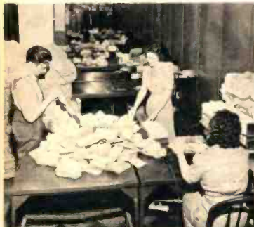
WHO KNOWS — THE WINNING LETTER MAY BE IN THIS BATCH

In case you're determined to win some of that "easy" money, here are a few points to keep in mind. If you don't follow the rules, there's no point wasting the postage. The same holds true if you write illegibly. Keep in mind that you'll be up against thousands of other "easy" money seekers, many of whom will send in entries that would do justice to a $15,000-a-year copywriter. So unless you're willing to take a little time and do a workman-like job, you'd be better off to put your money on a sweepstake ticket—it'll stand more chance of bagging a winner.