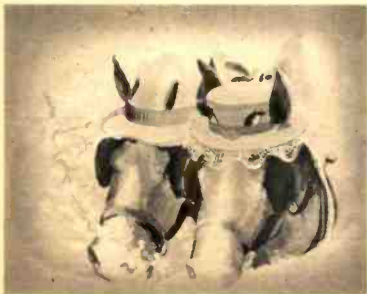
JOHNNY FEDOBA AND ALICE BLUE BONNET HAVE A LOVE AFFAIR