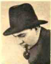
8. WHODUNITY? Whodoesit? Who brings you adventure, mystery and drama Friday nights on NBC's "Mystery Theatre"? He narrates one of today's hit chill shows. What's his name?