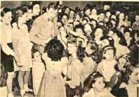
AT LONG LAST SUCCESS—WOMEN! AND THEY'RE NEVER TOO YOUNG FOR YOUNG

That did it. I gave up. I guess I just don't have the makings of a great lover. I don't know why. I have a smile like Tyrone Power, hair like Van Johnson, teeth like Robert Taylor, and a build like—like—uh, Mickey Mouse. Say, maybe that's what did it?