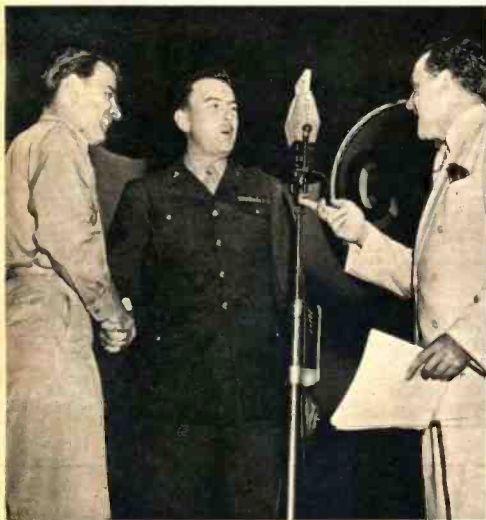
THERE WAS MANY A DAMP EYE WHEN SHOW REUNITED THESE LONG-SEPARATED BROTHERS