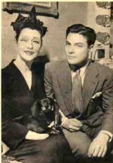
LYNN FONTANNE—MISS LINNEY TO DONALD—GOT HIM STARTED