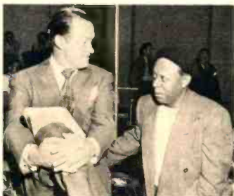
GIMME BENNY! After working for an hour with old "Ski Snot," Rochester was willing to go back to Jack Benny and work for nothing.