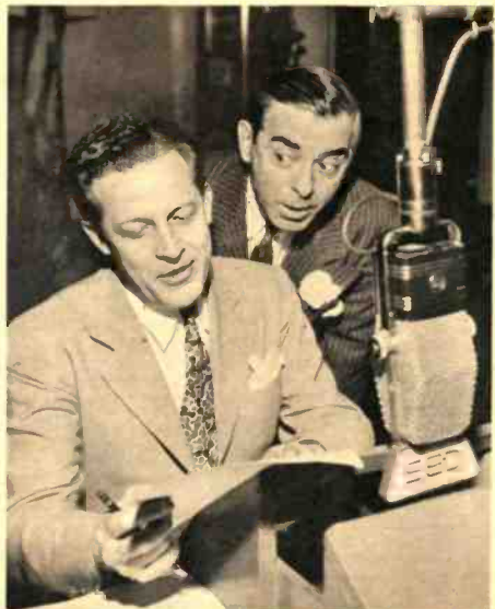
EDDIE CANTOR SNEAKS A PERK TO MAKE SURE EMCEE MILO BOULTON FOLLOWS THE SCRIPT