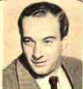
2. THE UNMELANCHOLY DAME is as adept at a wisecrack as he is at a piano. With the clarinet-speed rhythms of Benny Goodman, he's on NBC's Monday night Parade of Stars. His name?