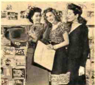
THE ANDREWS SISTERS SING THE ROMANCE OF THE TWO HATS