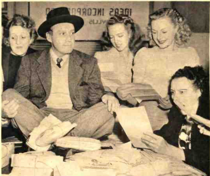
JACK BENNY HAD TO DRAFT THE WIVES OF HIS SCRIPT WRITERS TO READ AVALANCHE OF LETTERS RECEIVED IN HIS CONTEST