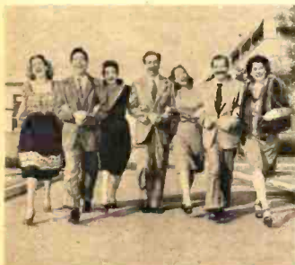
THE ANDREWS SISTERS, RUSSELL, DISNEY, SHORE, COLONNA