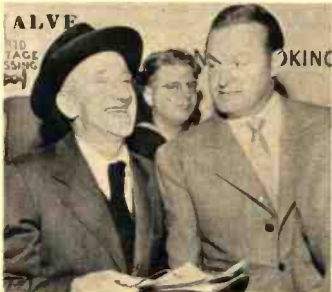
THE WO'S HAVE IT , referring, of course, to Jimmy Durante's schnozzle and Bob Hope's ski snoot. The famous funnymen are taking a busman's holiday—laughing at each other's corny gags.