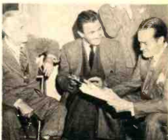
FUNNY SCRIPT. There were plenty of laughs on show. Eddy Duchin and Hope run over a funny segment as Frank Morgan looks on.