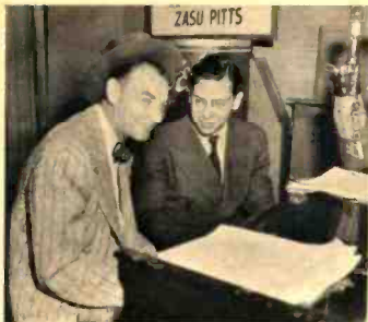
ONE-ZY, TWO-ZY, BOYS , and be sure you keep together. Ed Gardner (Archie of Duffy's Tavern) and Gershwin maestro, Oscar Levant pound out a duet before a rehearsal for a CBS studio program.