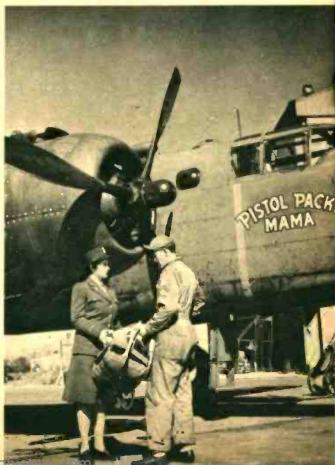
AN AIR TRANSPORT COMMANDO WAC'S DUTIES INCLUDE TOURS BY AIR