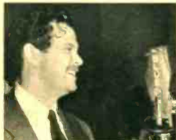
1 This noted actor-producer-director-amateur magician is: (A) Norman Corwin (B) Orson Welles (C) Arch Oboler

QUIPMASTER OF "THANKS TO THE YANKS" (CBS)