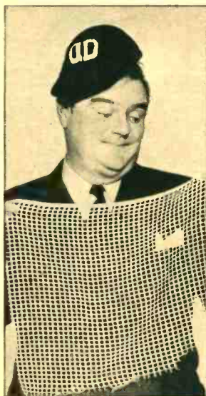
PRE-SHRUNK NET for wartime tennis is a boon to short-legged players who could never leap over the old-style models for newsteel shots.