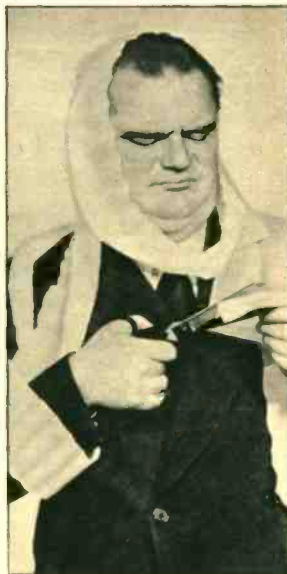
FIRST AID WORK is no problem, under the Colonel's system—simply start from the middle of the bandage roll, then work your way out.