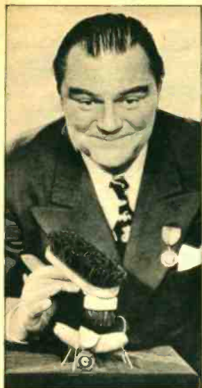
GIDDY GOURMET: "Stoop" believes in giving a hot dog the brush-off, even before he eats it. And both of them get medals—for gallantry.