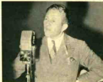
EMCEE ART LINKLETTER LURES THE VICTIMS

has ever suffered through the nightmarish agonies of appearing in a public place improperly clothed, or making himself ridiculous to a huge crowd of people, can scarcely believe that all the gold of Midas would tempt him to suffer voluntarily.