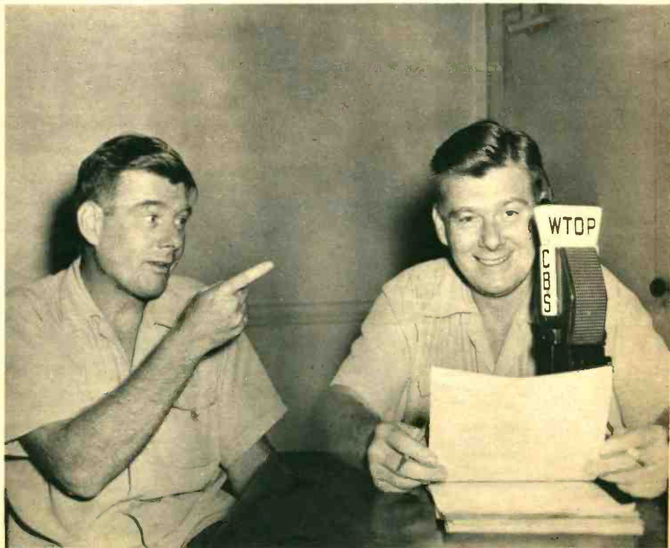
ARTHUR GODFREY'S CONSCIENCE IS A FREQUENT STUDIO VISITOR, WARNING HIM AGAINST MAKING EXAGGERATED CLAIMS FOR SPONSORS

Every once in a while, of course, one of A.G.'s bright ad-libbing ideas lands him in the soup. He's only surprised that it doesn't happen oftener. Then he has to make a personal appearance before a sober and indignant board of