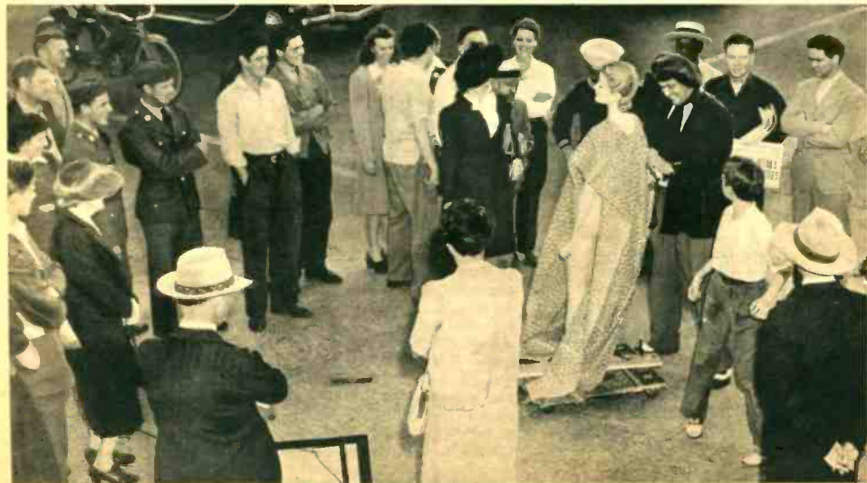
PASSERSBY STOP TO WATCH AS A "DESIGNER" FUMBLINGLY BEGINS HIS ASSIGNMENT OF CREATING A GOWN FOR A STORE-WINDOW DUMMY