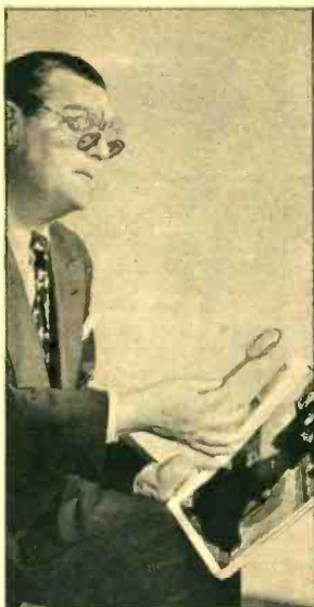
PICTURE-GAZING can become a burning passion, with plenty of spectacles—and a magnifying glass which can literally scorch the pages!