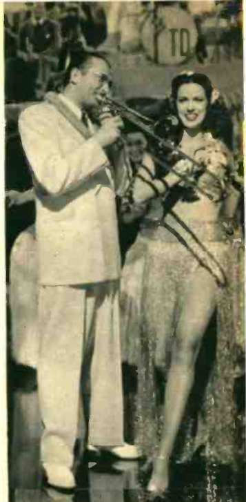
EVEN WITH A LEI around his neck, Tommy looks the impeccably-groomed business man.

After that, Tommy started rooting around with various other outfits, starting with the "Scranton Sirens," and working his way through the "California Ramblers," Jean Goldkette's band, and assignments with Roger Wolfe Kahn and Paul Whiteman. In fact, during a period of about ten years, the swingster managed to run up something of a record by sitting in with about every name band in the country. It was an era when records were booming, and radio and stage bands in great demand—making free-lancing very lucrative for a