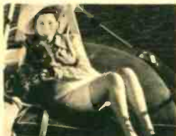
6 Taking life easy on her sun-kissed yacht is the comedienne: (A) Minnie Pearl (B) Cass Daley (C) Judy Canova