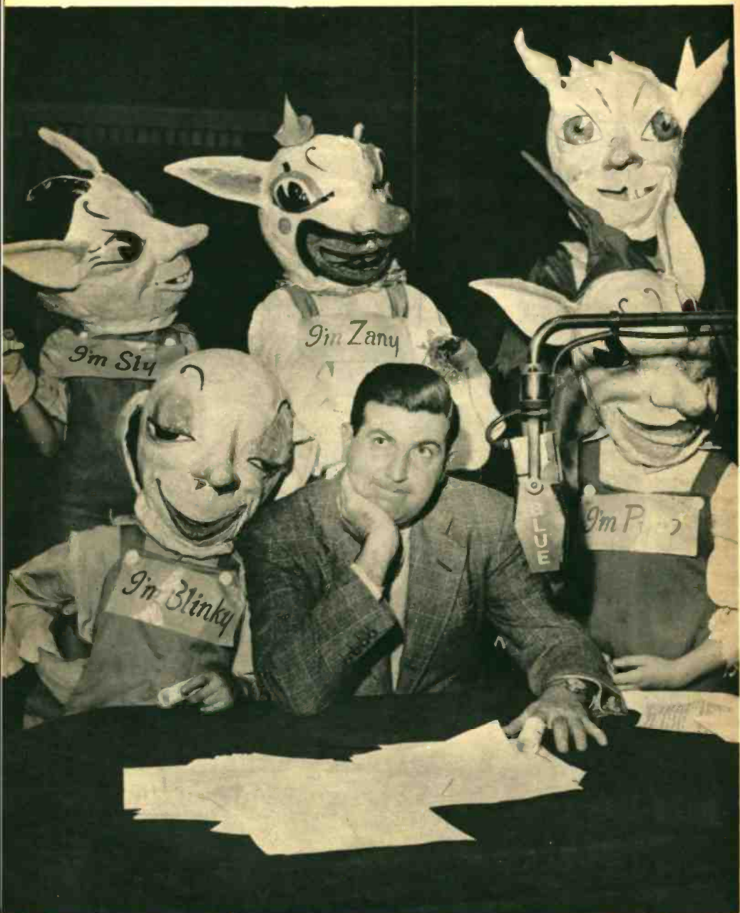
STRANGE BEASTIES ARE NO NOVELTY AT DON McNEILL'S "BREAKFAST CLUB," WHERE ALMOST ANYTHING CAN HAPPEN — AND USUALLY DOES