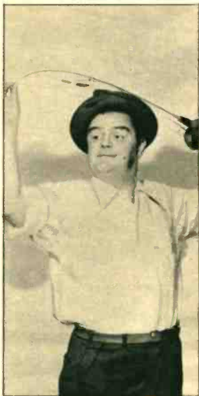
COMPLETE ANGLERS , he believes, will find a knowledge of fencing technique handy—particularly if it's a swordfish that they're after!