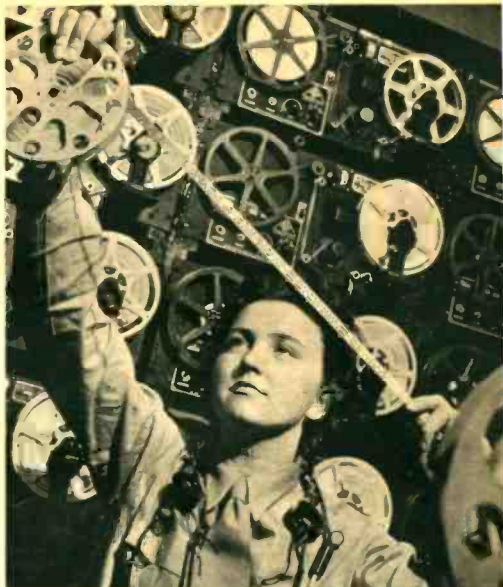
SPECIALY-TRAINED WACS HANDLE ARMY'S SECRET CODE MESSAGES

Though the Bureau considers this dramatic series one of its most important functions, there are many other aspects to the work of the recruiting service. A staff of artists is kept continually busy sketching the drawings and posters which are so prominent a part of the war-time American scene. Additional writers, too, spend their time putting together magazines and pamphlets which explain the work and needs of the service. Soldier-printers turn out, as a result of these activities, millions of copies of printed matter a day in the huge plant set up on Governor's Island. But none of these appeals is more effective, in challenging the spirit of the American patriot, than radio's dynamic "Voice of the Army."