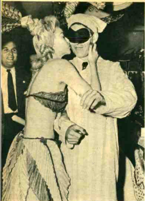
AN EARL CARROLL BEAUTY GREET'S THIS MYSTIFIED "SLEEPWALKER"

or not. Moreover, large numbers of persons (except extremely sensitive plants) love to be embarrassed themselves—if they've got a good enough excuse for it, and especially if it makes them the center of attraction.