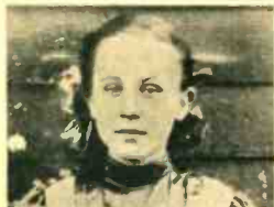
3 This child-photo of a comedy team's feminine half shows: (A) Molly McGee (B) Gracie Allen (C) Portland Hoffer