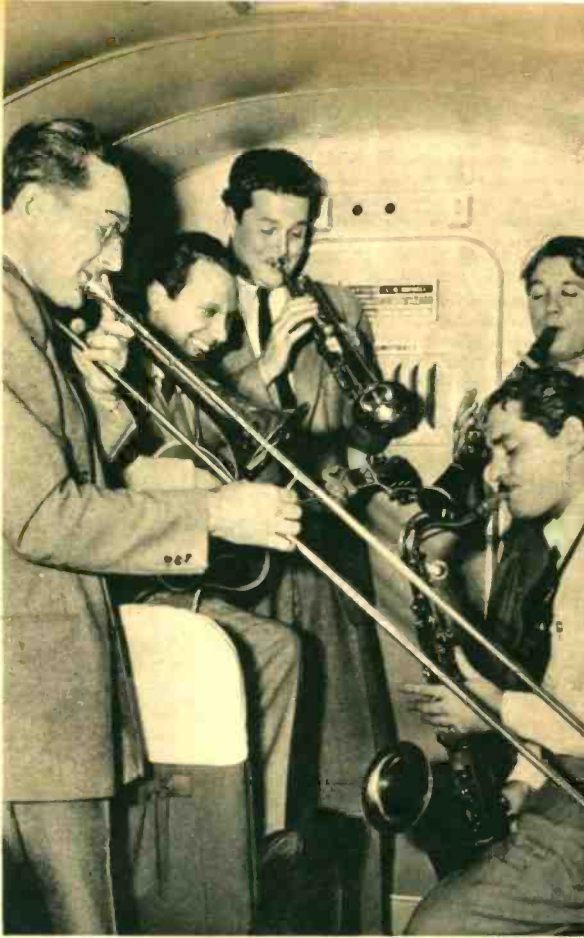
THE MAESTRO MANAGES TO SQUEEZE IN A JIVE SESSION WHILE THE BAND IS TRAVELING