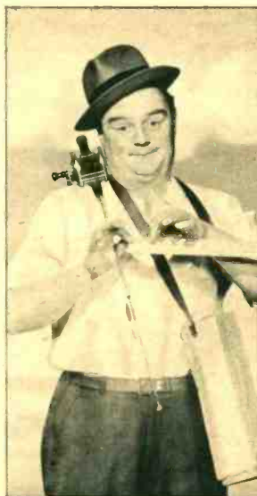
"GOLDEN RULE" for silver-tongued fishermen should help convince the stay-at-homes who never even glimpse the ones that got away.