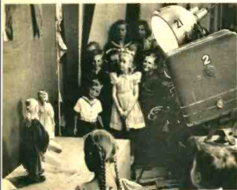
WRGB Carnival: Children of television set owners in the Schenectady, N. Y. area attend a broadcast and party at the station.

TELEVISION will not merely add sight to sound, but will also make many new types of program available to America's radio listeners. Vaudeville and circus fans will be able to see, right in their own homes, the acrobatic stunts and trained animal acts they now enjoy only in theatres. Sports lovers will no longer have to imagine the home runs and "men-o'-war" they've heard described. And followers of the news will watch headlines actually being made through the camera's eye.