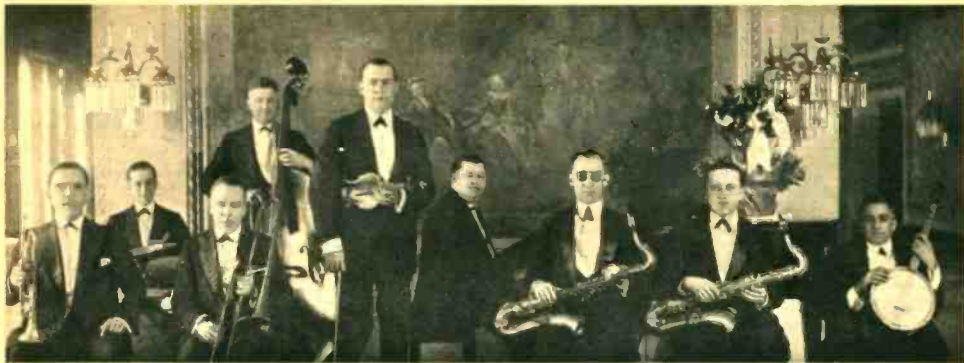
HISTORY WAS MADE BY THIS BAND — WITH A YOUNGER, SLIMMER PAUL AS ITS LEADER — AT LOS ANGELES' ALEXANDRA HOTEL, IN 1919

Most of them were sure that the American public wouldn't go for anything as new-fangled as that. They said that the public wanted its jazz "jumpy" and its symphony "sedate," and never the twain would meet. Well, they did meet—and the results at that time made musical history.