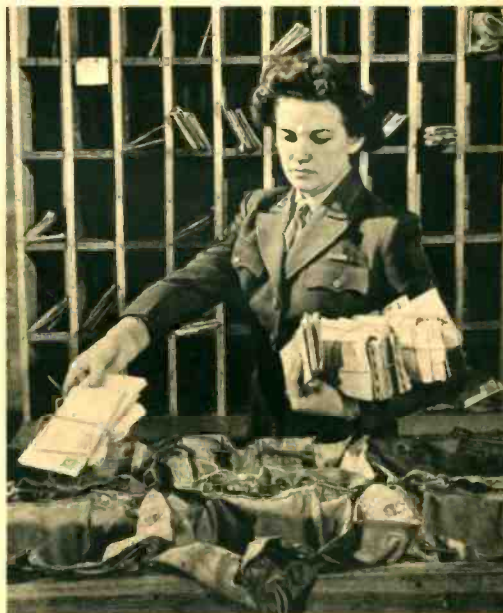
DISTRIBUTING MAIL FROM HOME IS A MORALE-BUILDING JOB.