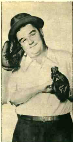
DIAMOND-BRIGHT is the Colonel's discovery that a third arm can be as useful as a three-bagger in baseball—and cause much more comment.