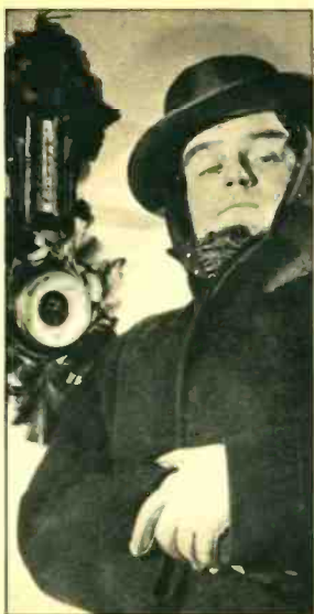
MAN OF FASHION: Midsummer or no midsummer, the Colonel takes no chances on being thinly clad when barometer reads "stormy."