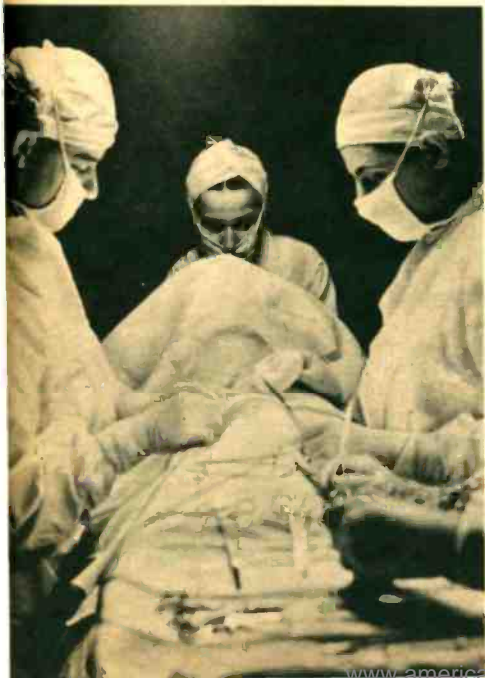
A NURSE ADMINISTERS ANAESTHESIA TO A SOLDIER IN ICELAND