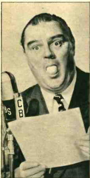
HE DEMONSTRATES the nightmare of all radio comedians, who fear that their most cherished jokes will "lay an egg"—verbally, of course.