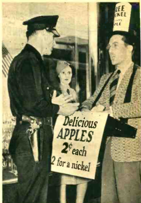
A POLICEMAN CAN'T SEEM TO UNDERSTAND THIS BARGAIN IN APPLES

Everybody on the show agrees, however, that the credit for their success must go where it belongs—to the People who Are Funny. They're not only funny, but good sports as well.