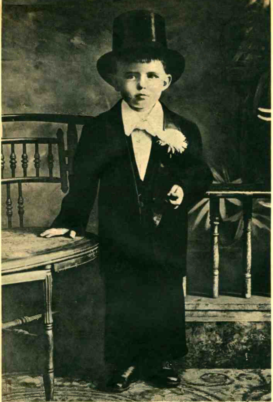
FRANK SINATRA AT THE AGE OF THREE WHEN "THE VOICE" WAS JUST A WHISPER.