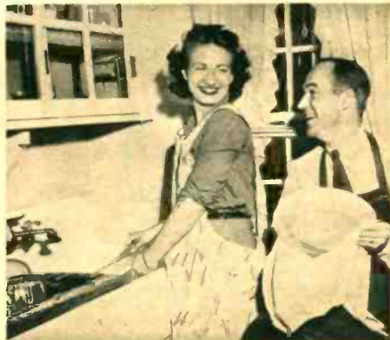
THE FRANKS SAVE DISH-WASHING UNTIL AFTER THE BABY'S IN BED