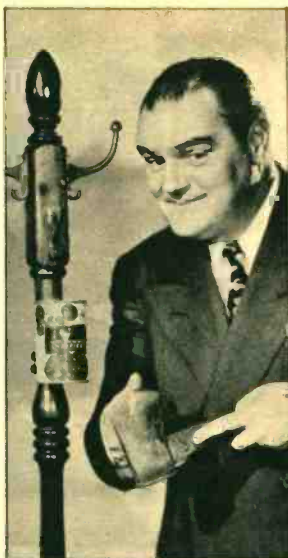
"G. WASHINGTON" Stoopnagle invents his own cherry tree—a can of fruit on a coat-tree. A real hatchet quickly finishes off the illusion.