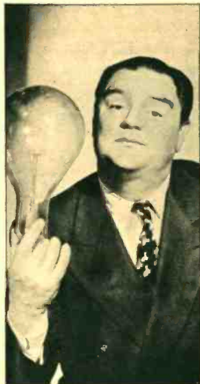
"BRIGHT IDEAS" come to the Colonel at such high voltage that out-sized light bulbs are a necessity for his electrifying discoveries.