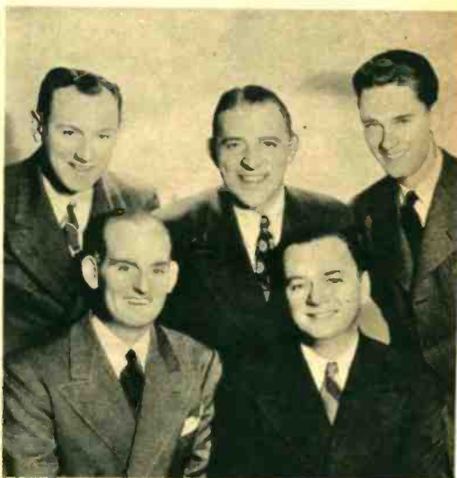
"THE CADETS" ARE ONE OF SEVERAL GROUPS PROVIDING MUSIC