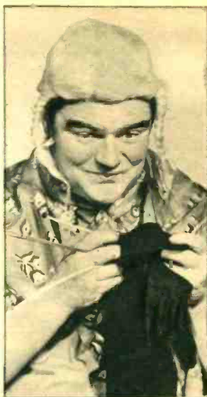
HAPPY HOMEBODY: Knitting was a quiet hobby—until white-wigged "Grandma" Stoopnagle applied many-needed mass production to it.