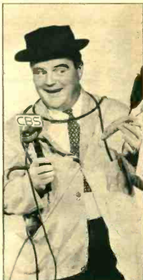
INDIAN BANANAS —feathered for aiming slippery peels where they can do the most "good"—offer a sure source of rainy-day merriment.