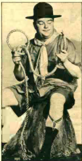
BIG BOY SCOUT: "To knot, or not to knot"—that is the question. Struggle between Stoop and the rope seems to have ended in a tie.