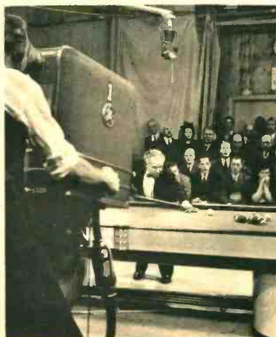
Billiard fricks are demonstrated for dialers by Andrew Ponzi, pocket billiards champion, in a General Electric program.