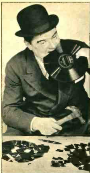
RECORD-BREAKING invention: "A dainty disk to ser before a king," muses Stoopnagle as he eats his own words—or reasonable facsimile.