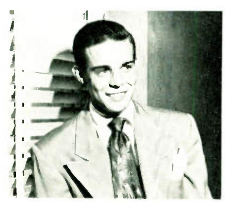
Har y Hall rose to singing fame on radio's "Arthur Godfrey Show" and "Breakfast Club."