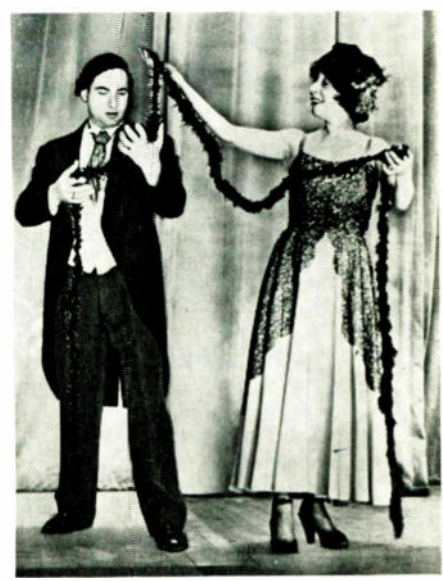
The pair burlesque a fashion show.

"Your Show of Shows" is seen Saturday over WOC-TV at 8 p.m.