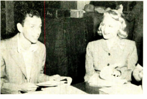
Frank Sinatra chews over the script during rehearsal with the blonde chirper.