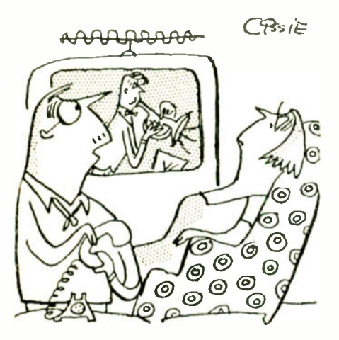
It's the neighbors—they say either turn down the set or invite them over.