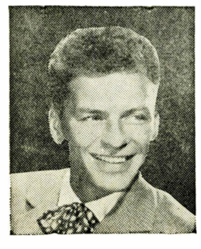
". . . a toastmaster"