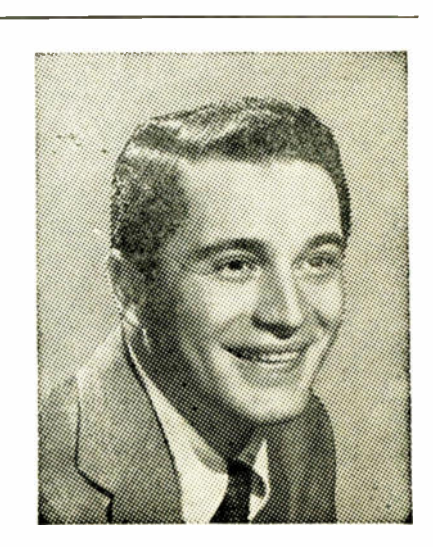
". . . a singer"