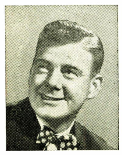
". . . a citation"

The "Michael" awards are based on the results of a poll of approximately 5,000 persons in the radio and television industries.