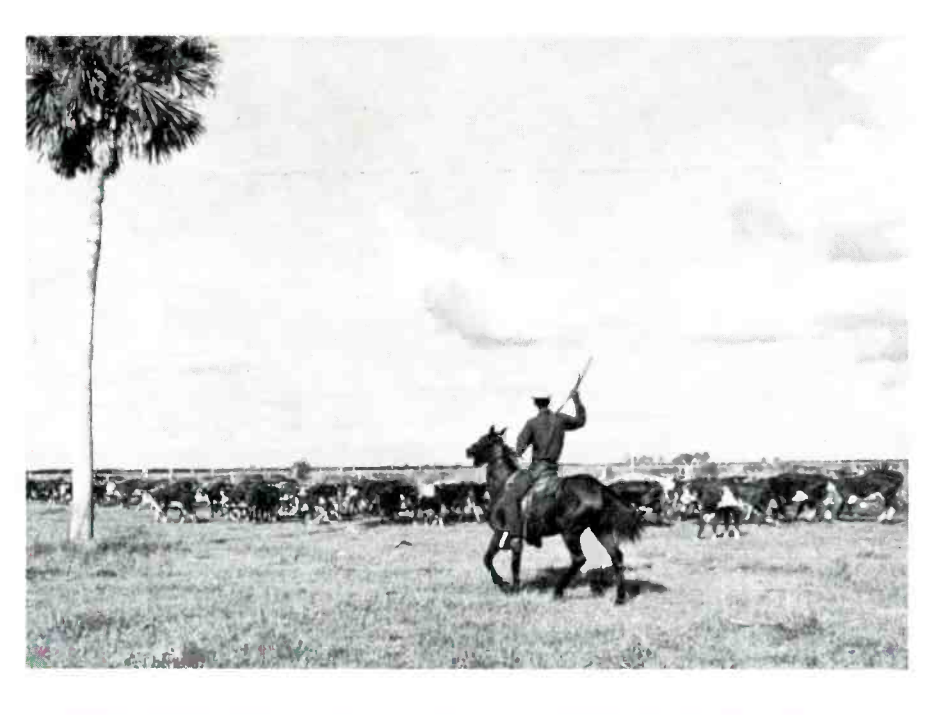
DAIRY PRODUCTS — $86 MILLION — LIVESTOCK $83 MILLION **