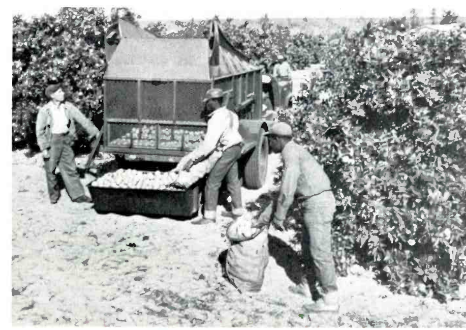
126.088 PERSONS IN FARM HOUSEHOLDS PLUS A LABOR FORCE OF 53,697. **

In the 33 Counties Covered by WGTO Farm Product Sales