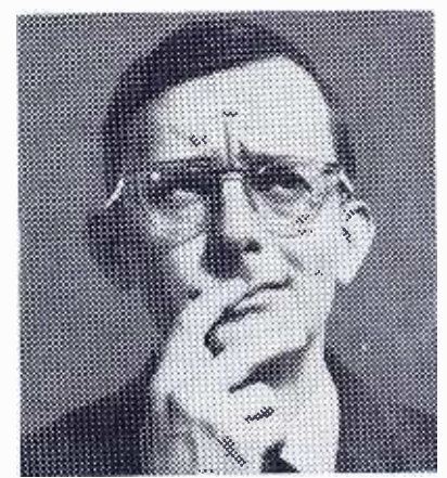
Lovable Mr. Peepers in the person of Wally Cox returns to entertain his many Channel 6 followers Sunday, September 13 at 5:30 p.m. More news on returning shows, old and new, can be found in