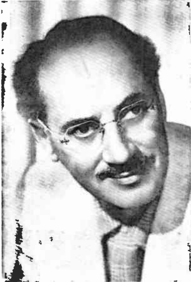
GROUCHO —One of many winners.

Nine NBC radio and television stars and programs won first place honors in Radio Daily's annual poll of outstanding radio and television