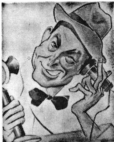
Archie says—Sure "Duffy's Tavern" is a "Tandem" Show.

Called "Operation Tandem" the plan is built around NBC's new 90 minute super-program, "The Big Show." It provides all parties concerned with a diversified programming plan that includes variety, comedy, drama, adventure and music.