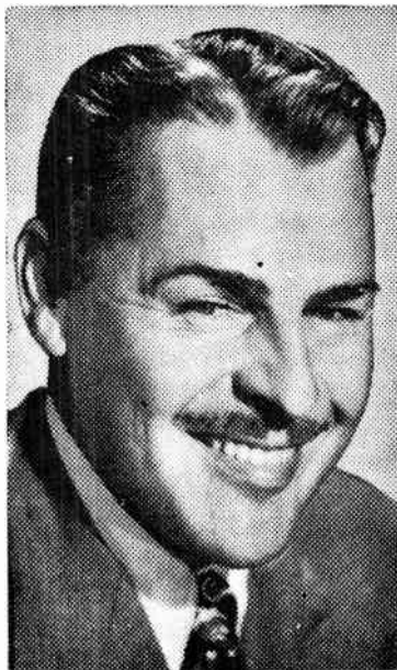
GOVERNMENT AGENT—Brian Donlevy covers a "Dangerous Assignment" each Monday night at 9:30.