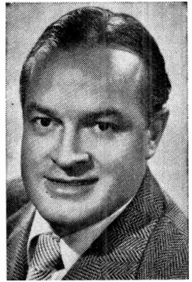
BOB HOPE SHOW —Here is the head man himself, Bob Hope. The zany rapid-fire gagster entertains with laughs each Tuesday night at 8.