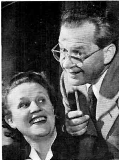
FIBBER MCGEE AND MOLLY —Marian Jordan stars with her husband Jim in 30 minutes of top-notch fun each Tuesday night at 8:30.