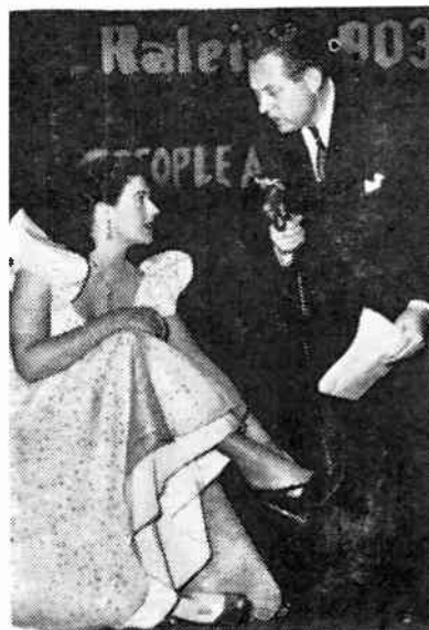
Emcee Art Linkletter of "People Are Funny" tried the slipper on Omaha's Raleigh "Cinderella Girl" and it fit. She got her greatest wish!