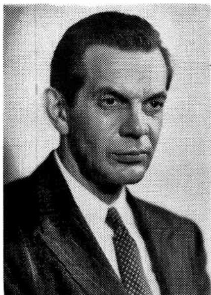
CAVALCADE OF AMERICA —Raymond Massey recently starred as Abraham Lincoln in this weekly drama series about persons and events.

Art Linkletter brings a program of fun and surprises at 9:30 with his "People are Funny" show. The popular emcee presents 30 unusual minutes of entertainment for Raleigh Cigarettes.