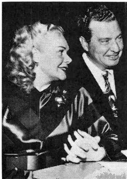
Alice Faye and Phil Harris

The King's Men Quartet, heard on the Tuesday night "Fibber McGee and Molly" show and "Hymns of the World" each Sunday, recorded a new version of "I Can't Give You Anything But Love, Baby" for the March of Dimes campaign. The theme, with new lyrics by Jimmy McHugh, re-titled "I Can't Give You Anything But Cash, Baby" was used by radio stations to help the infantile paralysis fund drive.