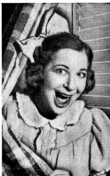
BABY SNOOKS SHOW —Here's comedienne Fanny Brice all done up as the mischievous Baby Snooks. Hanley Stafford plays the tormented "Daddy."