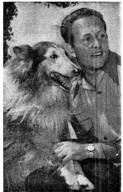
TRICKSTERS —Art Linkletter and his trick-performing collie, King, in a moment of relaxation. Art emcees the popular Raleigh show "People Are Funny" at NBC and WOW Tuesday nights at 9.