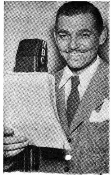
CLARK GABLE , Walter Pidgeon, Van Johnson, and others will be in "Command Decision" soon with the Camel Screen Guild Players in a top drama spot on WOW Thursday nights at 8.