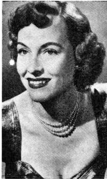
THE GIRL FRIEND — Virginia Gregg in the role of Helen Asher is the gal Dick Powell as Detective Richard Diamond gets goofy about when this popular whodunnit is aired Saturday nights at 6:30.