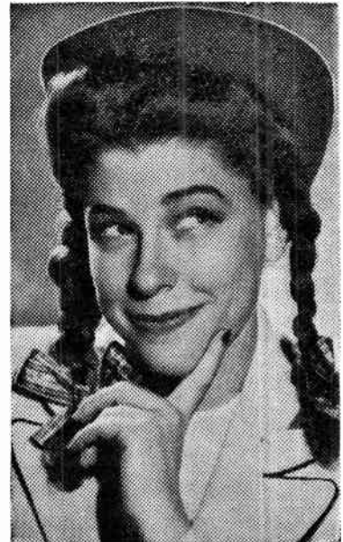
IN LOVE —AGAIN! Yep the queen of the hillbilly comedienne, Judy Canova, is in love again—in the script, of course) of her Saturday at 9 very funny Colgate show. It precedes Grand Ole Opry.