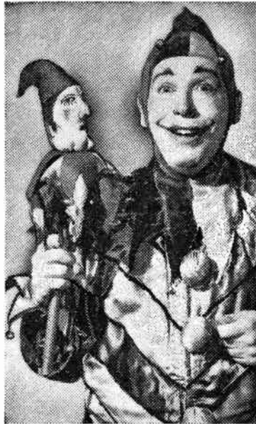
LAUGH CLOWN —Milton Berle's "Texaco Star Theater," top-rated TV show on the air is a great Tuesday night at 7 feature on WOW-TV. It offers top-notch guest stars, variety and comedy.