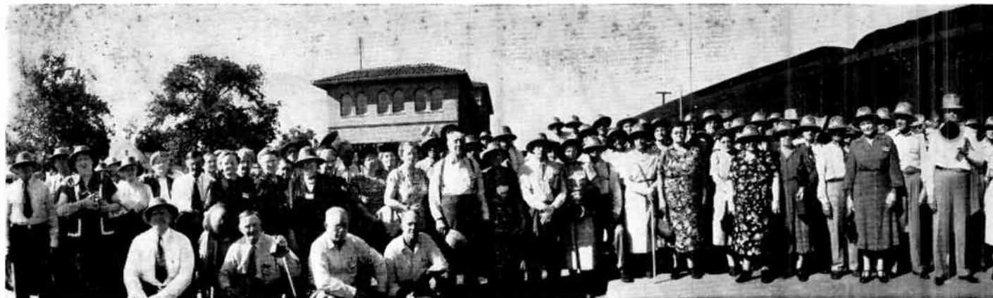
Members of the WOW Farmers' West Coast Farm Study Tour posed by its 17-car special train in Stockton, Calif. . .