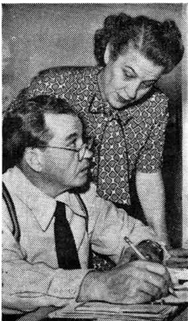
STILL ON TOP —Fifteen years at the same stand for Johnson's waxes, the beloved Fibber McGee and Molly are still on top in American radio. The same spot, of course, is Tuesday nights at 8 on WOW.

Jimmy Durante's favorite pastime as a kid was harmonizing on New York street corners with amateur quartets for the nickels and pennies that passers-by threw their way.