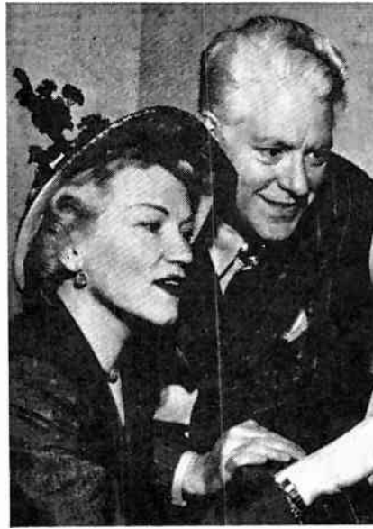
Dorothy Kirsten and Nelson Eddy