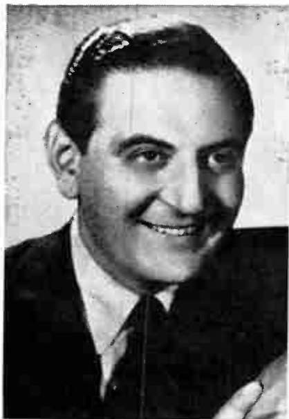
Guy Lombardo will be the summer replacement program for Phil Harris-Alice Faye under sponsorship of Rexall Drug (WOW Sunday, 6:30 p.m.)