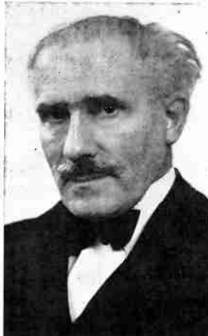
Arturo Toscanini is on summer vacation but the NBC Symphony which he has made famous is on the air over WOW for U. S. Steel every Sunday evening at 7:30. Guest conductors will lead the Symphony while Toscanini takes a rest.