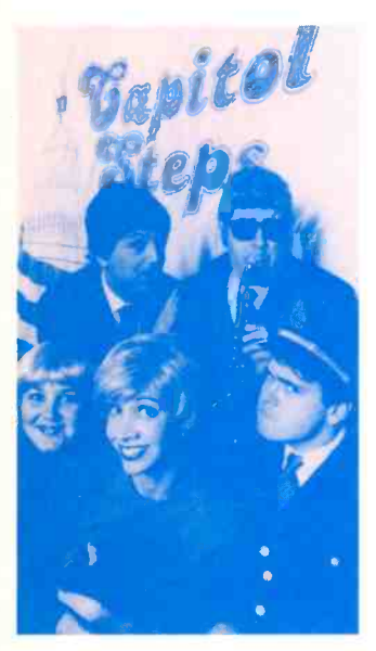
The Capitol Steps perform at Town Hall on Thursday, October 3