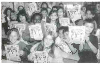
Students from P.S. 29, Cobble Hill, Brooklyn holding photos of Kids hosts