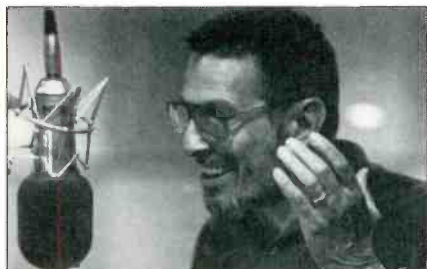
Leonard Nimoy hosts Jewish Short Stories