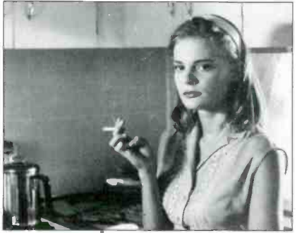
From A Blink of Paradise