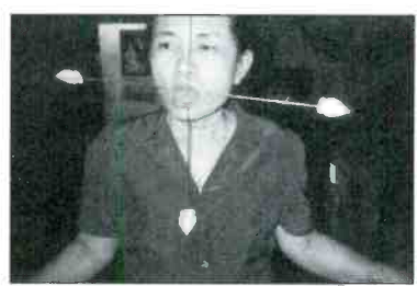
From Wondrous Events