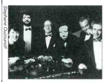
The Florence Gould Hall Chamber Players appear on Around New York Thursday, February 3 at 2pm. For FM music listings, see pages 6 through 12