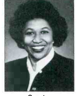
Senator Carol Moseley-Braun

The Talented Ten, AM820, Saturday, February 19, 8pm A quarter century after Shirley Chisholm became the first black woman to be elected to the House of Representatives, nine African-American women sit in Congress, and one is a member of the U.S. Senate. These women of the 103rd Congress tell their stories, presenting perspectives on the distinctive place they hold in society. The program focuses on their personal drive and motivation and on the positions and political perspectives they share.