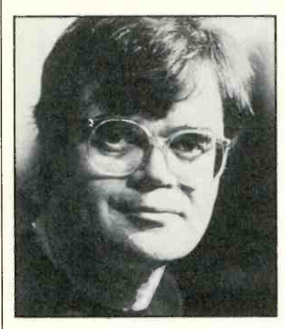
Garrison Keillor