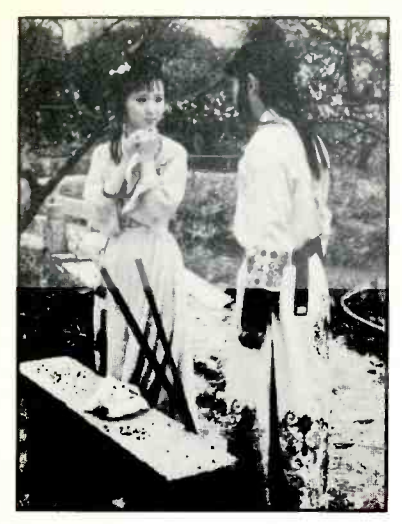
A scene from A Dream of Red Mansions.