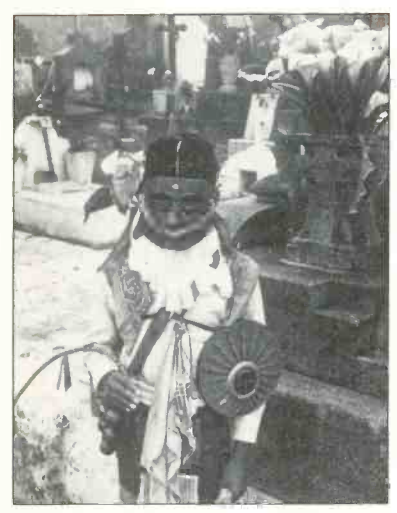
A Mexican Indian costumed as a conquistador.

TV31 observes Italian Heritage Month with specials, films, and series celebrating the Italian people.