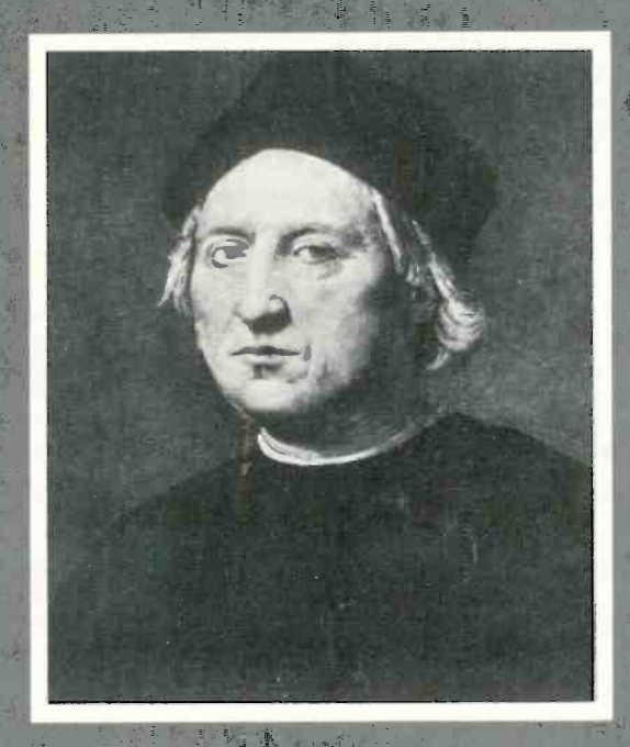
Columbus and the Age of Discovery, a seven-part series starting October 15

WNYC-TV Celebrates Italian Heritage Mont