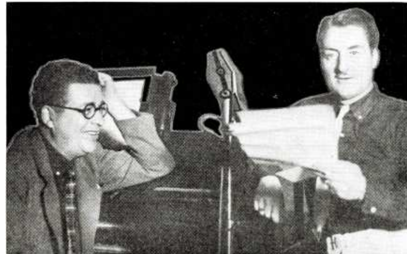
. . . the gag to the final explosion during the Top O' the Morning show.