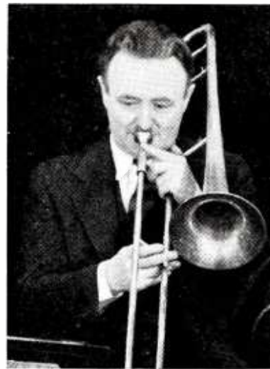
"Thar he blows!"