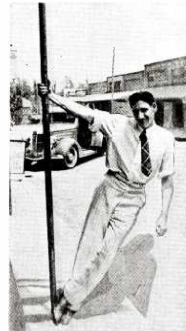
Pat Buttram, when he was hanging around in his native Alabama.