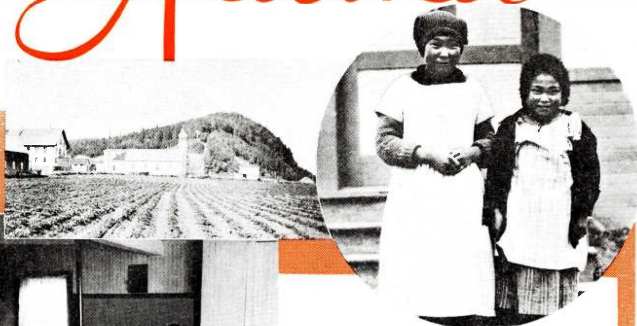
Holy Cross Mission, Holy Cross, Alaska.