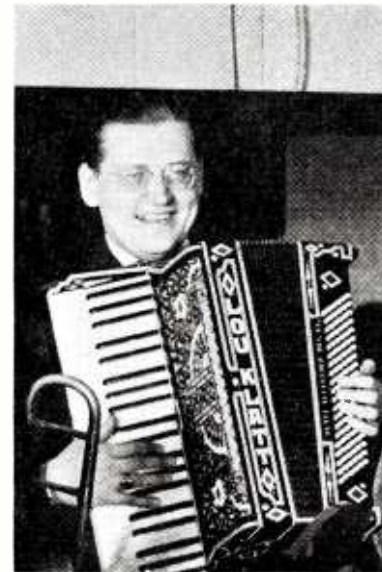
All set for a solo "break"

Following that he played in a number of theatre orchestras, including the largest chain in Chicago.