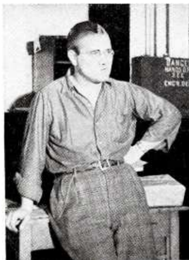
"Sleeps under blankets."

A card from Reggie Cross up at Tomah, Wisconsin. "We're freezing up here evenings. Blankets and sweaters to keep warm." There