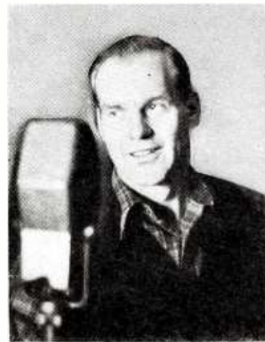
A NEW STUDY of the Arkansas Woodchopper in action before the mike.