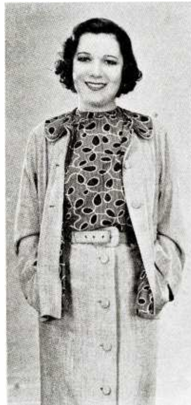
Tweeds strike the fall note.

Her latest suit, of smoky gray-blue tweed, has action pleats both front and back. Come to think of it, the