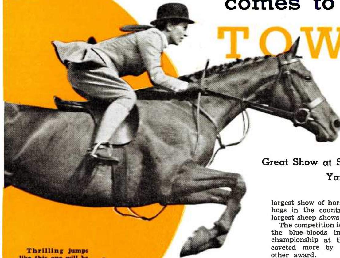
Great Show at Stock