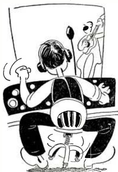
"They say he's the most expert spaghetti eater on the staff."