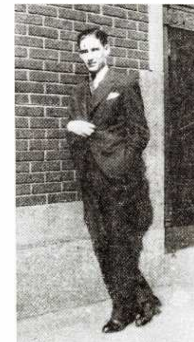
THE PRESIDENT of the Pat Buttram Radio School Fer New Beginners Jest Startin' is snapped in a mood of sweet, pensive melancholy or something.