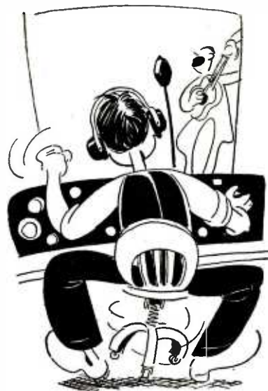
"This is what I call the wide open faces."