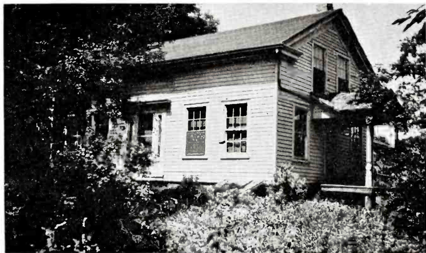
Indians still roamed the Northern Illinois prairies when this pioneer home was built near Palatine in 1837.