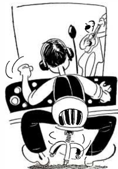
"Come on, fellow—sharpen it up."

Although he is one of the busiest men in the show business, Major Edward Bowes still finds time to put-ter around the vast flower gardens on his estate up the Hudson river from New York.