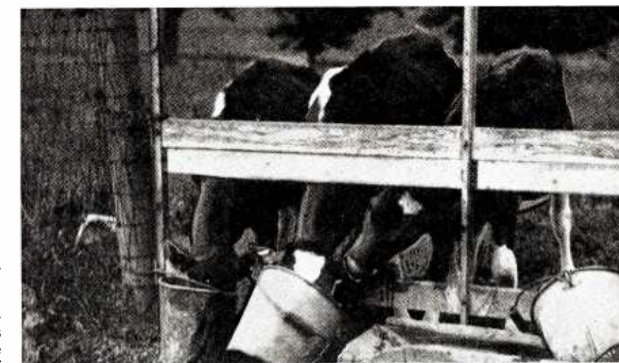
"Keep 'em a little bit hungry—that's the way to make 'em grow."

Joan Blaine, NBC dramatic star, has added the 150th cat to her oddly assorted collection. Joan's cats, however, require neither board nor much room, for they are not flesh and fur—they're china, gingham, porcelain, carved wood, wool, soap, chocolate, and what have you?