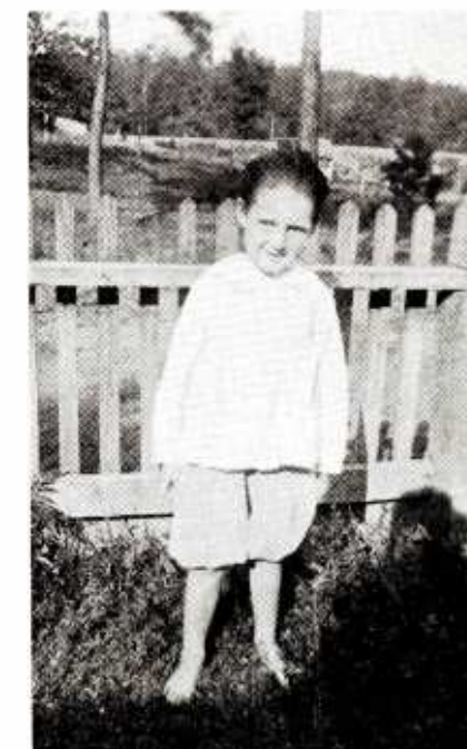
A rural philosopher at a tender age. It's Pat Buttram, who even then was the pride of Winston county, Ala.