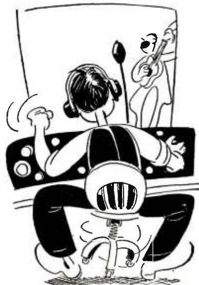
"I hope my mother still thinks I'm working in that pool hall."

This recipe was made for a mechanical refrigerator. If used in a hand freezer, use twice the amount of coffee cream instead of the water and whipping cream and freeze in the usual manner.