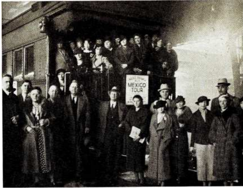
Start of the Prairie Farmer-WLS tour.