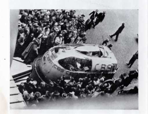
CBS Radio Bubble

The 1952 Republican and Democratic Conventions will be sponsored over WJLS by the Westinghouse Electric Corp.