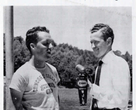
Reporter and Park Director "THE 560 NEWS"

The operator of a row boat would enter last. The others would enter, one at a time, from the front of the boat, remaining low