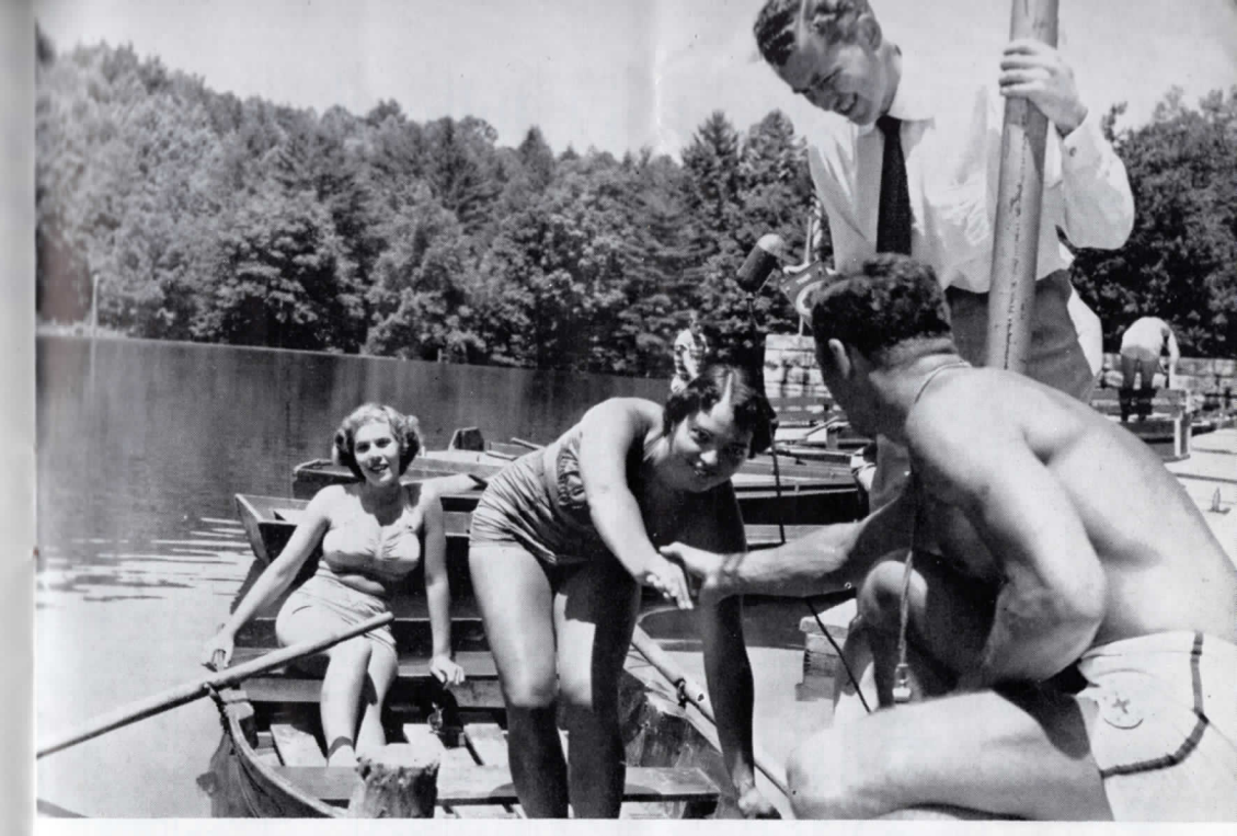
CORRECT BOATING PROCEDURE

tered the water too soon after eating. He also said that before diving in a river or lake, to be sure you learn the hazzards that might be beneath the surface of the water.