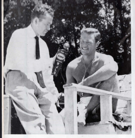
Esso Reporter and Life Guard

Water safety was the theme of a special Esso Reporter Broadcast on the night of June 17th. The Esso Reporter, during a 25-minute broadcast, interviewed the chief life guard at Raleigh County's Little Beaver Park. They talked of water safety regardless of where you might be spending your vacation.