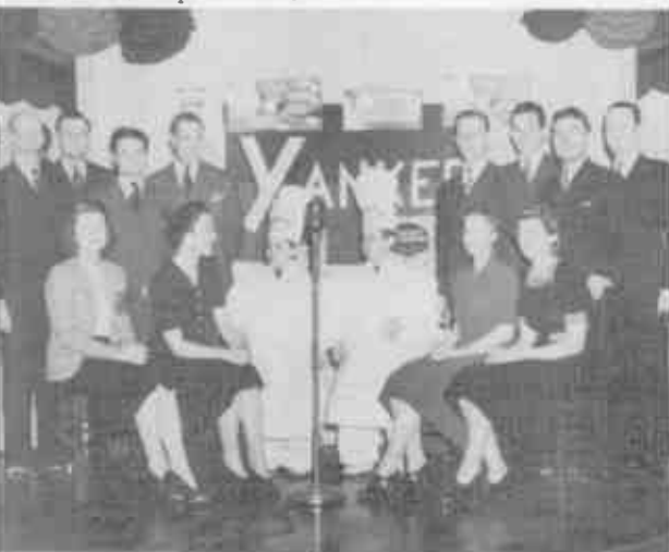
Left . . . THE "SUNSHINE NEWS REPORTERS" CAST

Director of The Yankee Network Sports Reporting staff, is an all-round "on-the-scene" sports announcer, special-events reporter and one-time NBC sports ace.