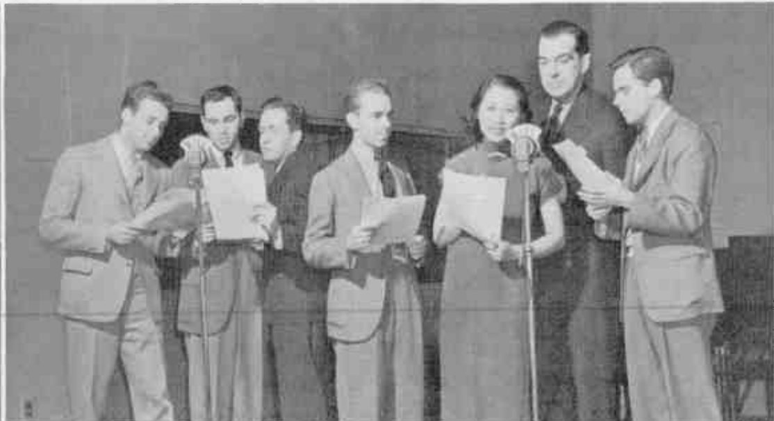
YALE "LISTENERS' THEATRE"

... Chaplain of Yale University, New Haven, under whose auspices services are broadcast from Battell Chapel, via WICC, Sundays from 11 A.M. to 12 Noon.