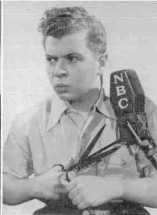
EZRA STONE of "The Aldrich Family"