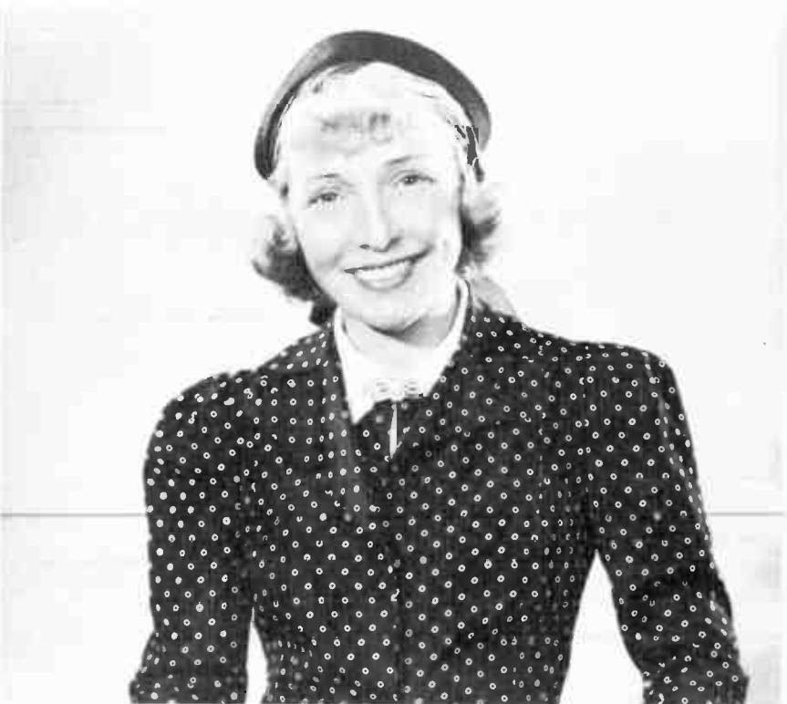
JANE ACE of "Easy Aces"