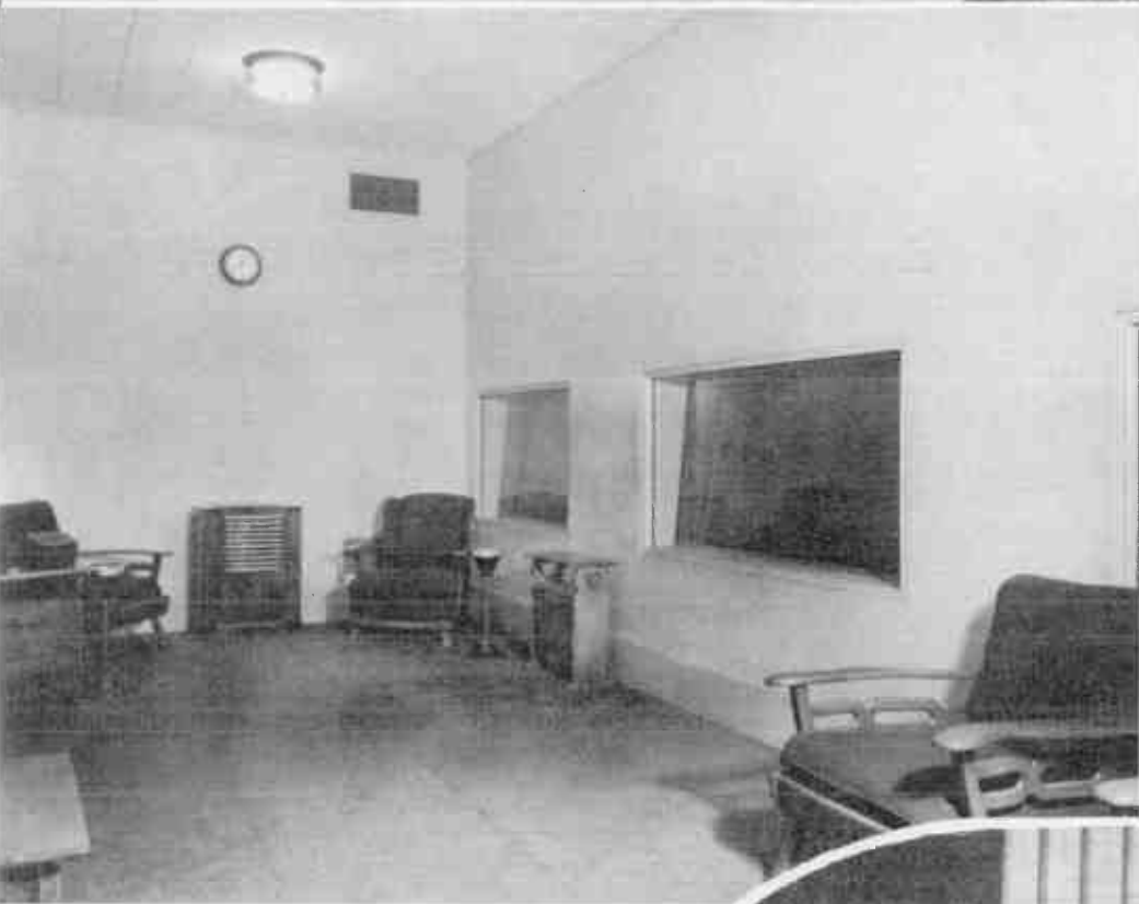
OBSERVATION GALLERY at the New Haven Studios of WICC.