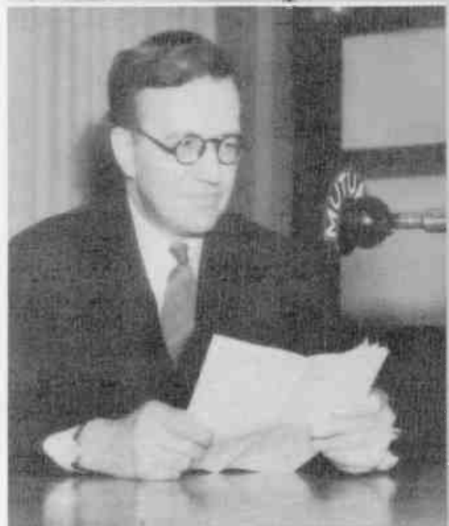
Right . . . RAYMOND GRAM SWING . . . noted news commentator.