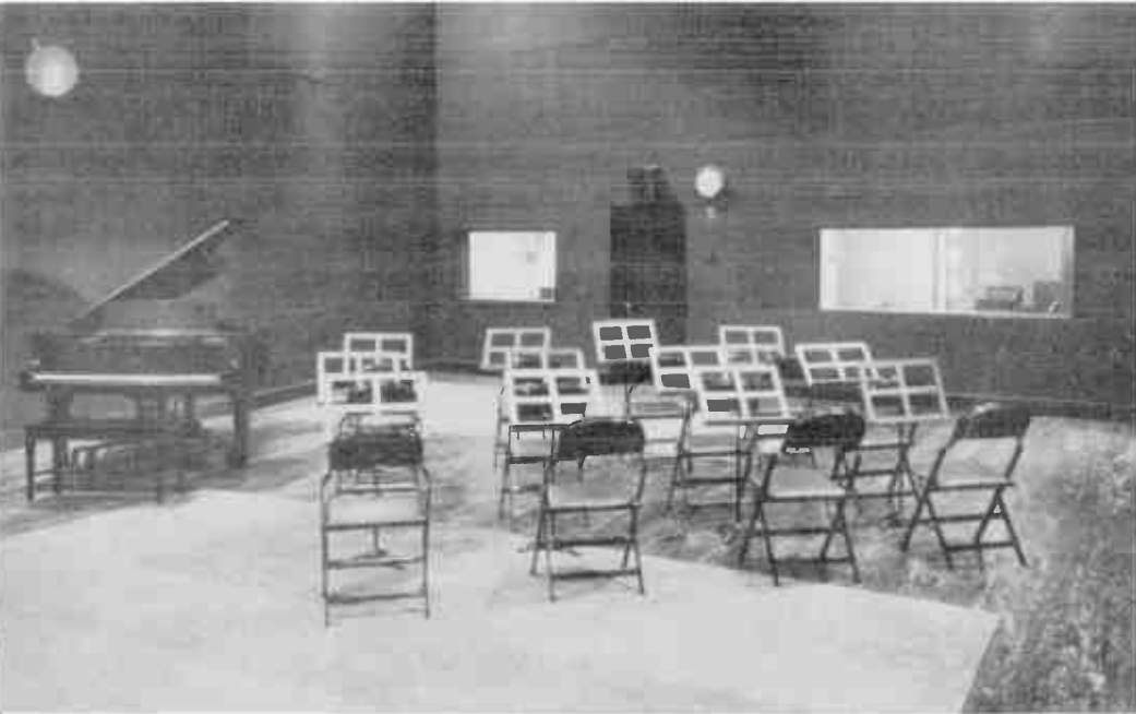
WICC'S NEW HAVEN STUDIO