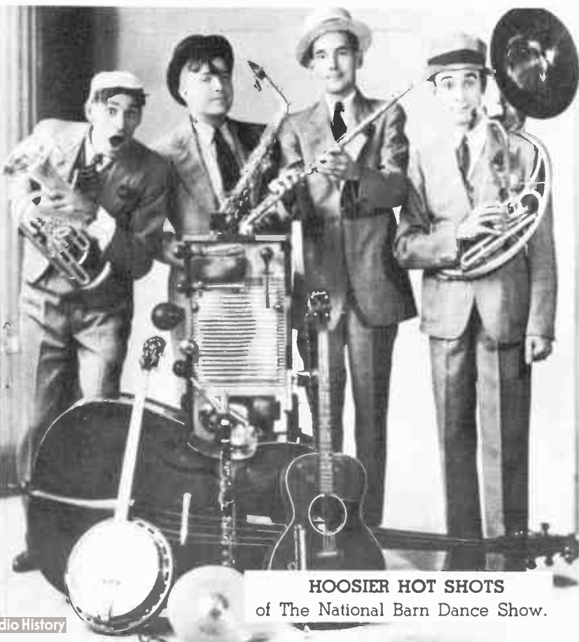
HOOSIER HOT SHOTS of The National Barn Dance Show.