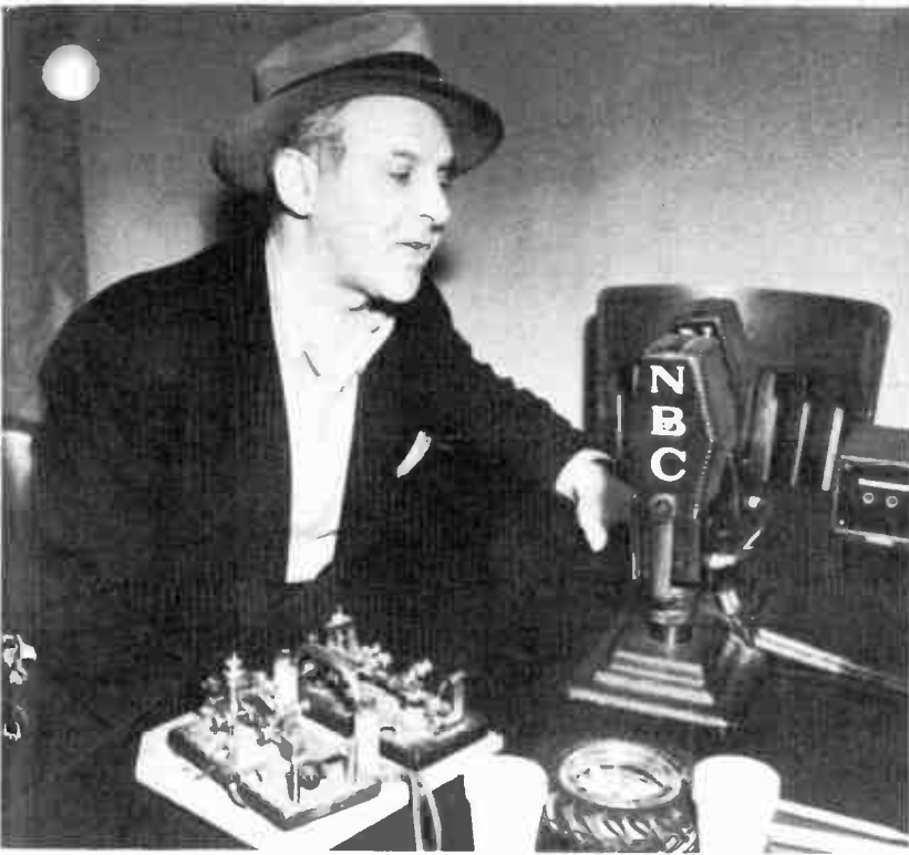
WALTER WINCHELL ... broadcasting.