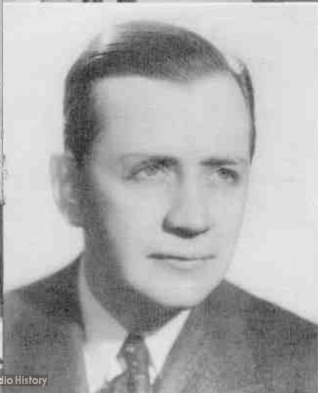
Left . . . TOMMY TUCKER . . . not so serious . . . when his orchestra plays.