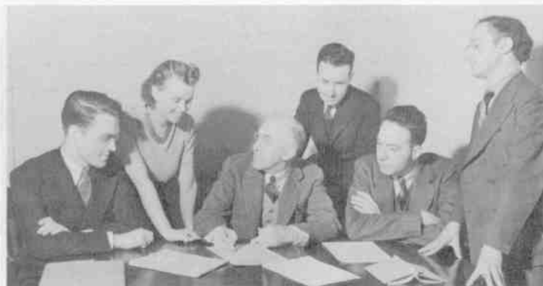
AUTHORS GROUP OF "THE LISTENERS' THEATRE"