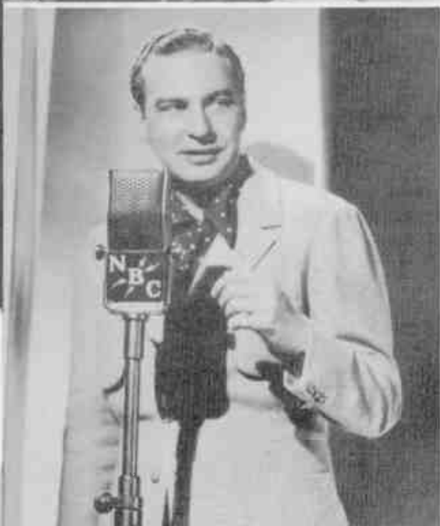
Left . . . PHIL HARRIS . . . You know his orchestra.