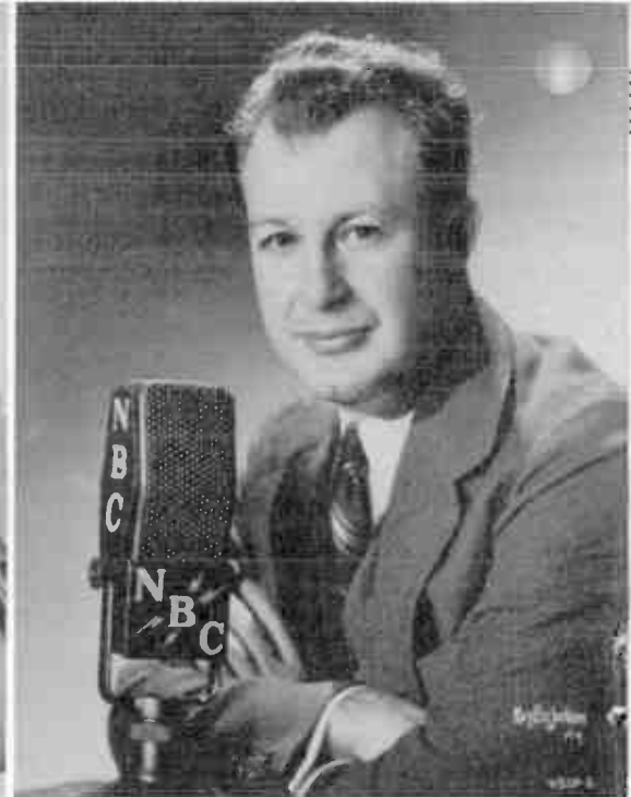
CLIFTON FADIMAN He dishes it out With the greatest of ease And knows all the answers On "Information Please!"