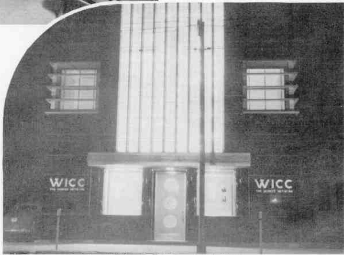
Exterior of WICC's New Haven building