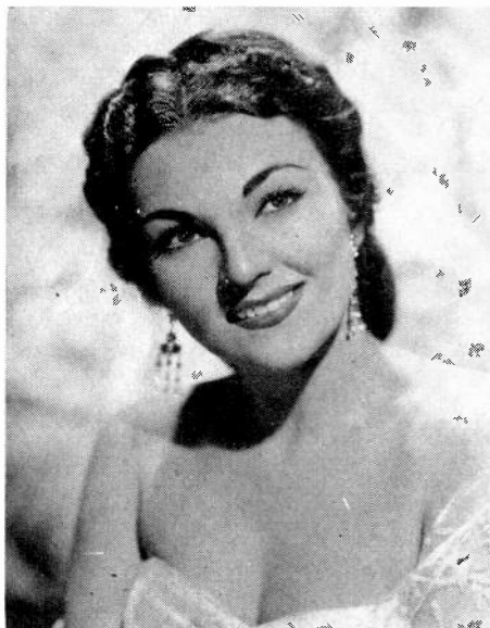
Marion Marlowe, featured singer on "Arthur Godfrey Time" was discovered by Godfrey during a visit to Miami Beach.