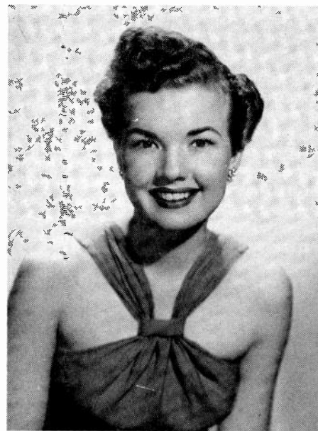
Gale Storm, star of "My Little Margie," looks like the 21-year-old girl she portrays; but she is the mother of three children. Her formula for good looks is: "Have a family—raising children is hard work."

Could a better new leaf be found for January, 1953, than a determination to get a true and clear view of the life of this remarkable American of the days when our nation was very, very young?