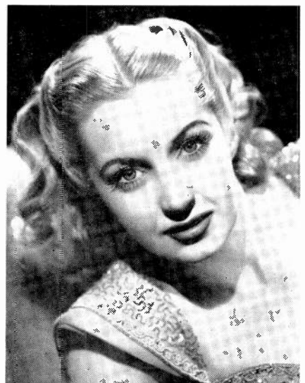
The newest addition to the Dick Haymes show is Martha Tilton, who sings lilting lyrics with Dick Haymes.