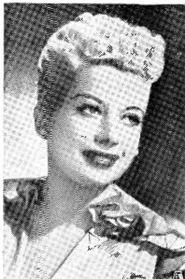
The lovely pictured above is none other than Helen Forrest, who is the envy of all teen-age (or over) female admirers of "Dick Haymes Show" Saturdays at 7:00 p. m. on WIBW.