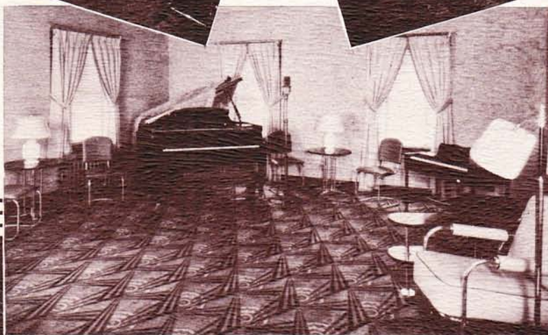
View of Studio B