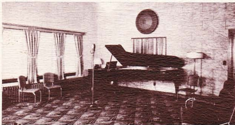
View of Studio A