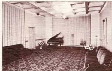
Two Views of Canton, Ohio, Studios: Main Studio and Reception Room

Radio Station WADC is proud of the new facilities which now enable it to serve its radio listeners even better . . . and trust that it will continue to merit the acceptance of those who welcome the best in radio entertainment.