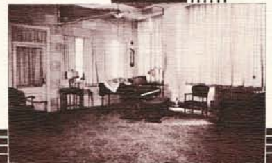
Downtown Studio of WADC Located in Beacon Journal Building

WADC also maintains a downtown Akron studio in the Beacon Journal building. Programs are broadcast daily from the above mentioned studios, from the main studios in Tallmadge, an Akron suburb, and from numerous remote points.