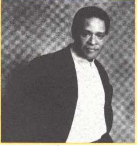
Al Jarreau Playboy Jazz Festival, June 17th