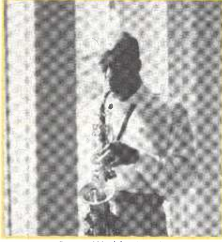
Grover Washington, Jr. Playboy Jazz Festival, June 18th