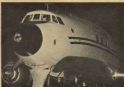
4:10 PM Finally, the Beatles arrive back in L.A. for their performance. Again, they lead secretly so that crowds wouldn't mob them. Again, KRIA is first on the scene! The boys were groggy and half asleep . . .