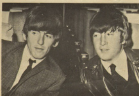
3:10 PM . . . BUT WAIT! WHAT'S THIS? WHY THE SURPRISED LOOK ON JOHN AND GEORGE'S FACES? COULD IT BE . . . YES, BY GUM, IT IS! THE BEATLES MAY BE LEAVING K'R'L'A'M'D. BUT KRIA ISN'T LEAVING THE BEATLES!