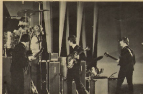
They look at Ringo . . . he adjusts his drums. Paul tunes his guitar. The audience screens louder and louder . . . finally, Ringo is ready. He gives the signal. The boys turn and face the stage . . . and sing.