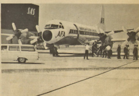
3:13 PM With the KRIA 'hooky-players' safely tucked inside, the doors are closed, and the plane takes off. Yes, they're gone. But don't cry too hard . . . because they'll soon be back!