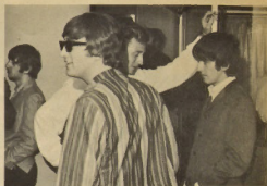
4:25 PM . . . But they still were able to smile and talk with KRIA newsmen. The only thing they could talk about, though, was getting some sleep before the long, hard day's night ahead of them.