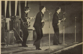
"I want to hold your hand . . ." The girls let him know by their screams that they want to hold his, rest! The screens go on . . . and the Beatles sing . . . and sing . . . and sing. There's never been anything like it!