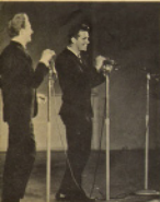
. . . the KRIA D.J.'s walk on stage . . . the audience grows quiet . . . there . . . HERE THEY ARE . . . THE BEATLES!!!!