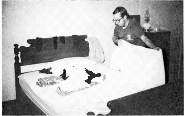
Sports Director goes about his monthly chore—making his bed. He just ignores anything on, hanging on or under it.