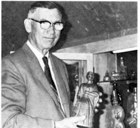
Joan of Arc is an opaque French decanter.