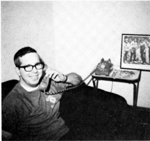
The picture on the wall shows the charter members of the Warren Swain fan club.