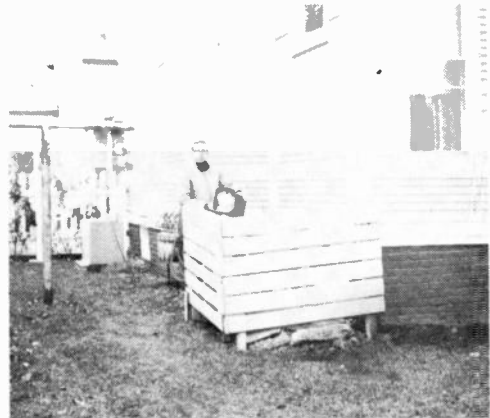
Warren can side-step the garbage until the end of the month when he covers the field with it.