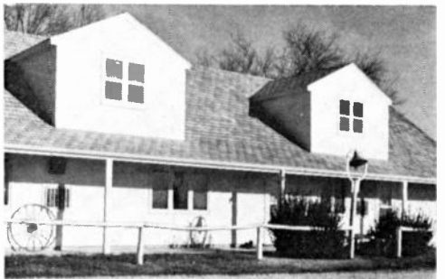
The House of a Thousand Bottles.