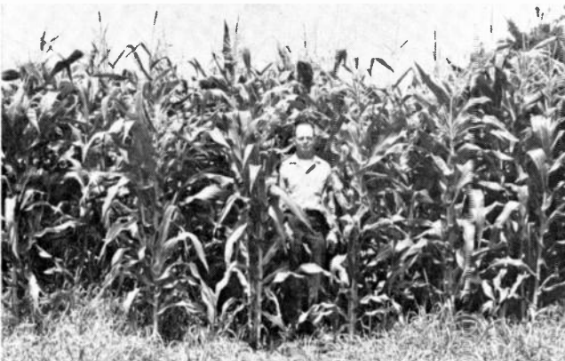
This corn was waist high 30 days ago.

I believe that we may see the time when we will utilize cloud seeding at sometime each year. One other point I should mention is that when you seed clouds, you reduce the chances of getting hail. In fact, some areas use it just for hail suppression and not to increase rainfall.