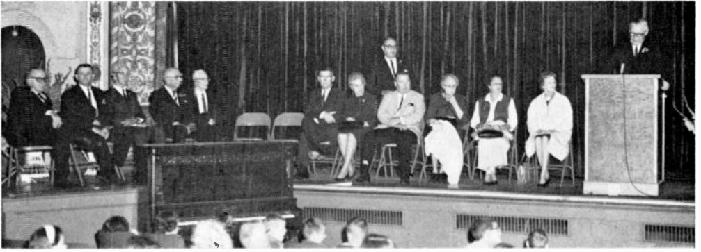
ABOVE — During morning program Iowa Congressman John Hansen spoke to the auditorium audience. Seated on the stage to his right are area committee workers of the Democratic Party.