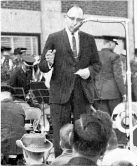
RIGHT — During the main program in the afternoon, Iowa U. S. Senator Jack Miller spoke from the stage. The audiences were given some interesting and aggressive legislative viewpoints by both political figures. They got right to the point and hit hard with discussions of great interest to people of our area.