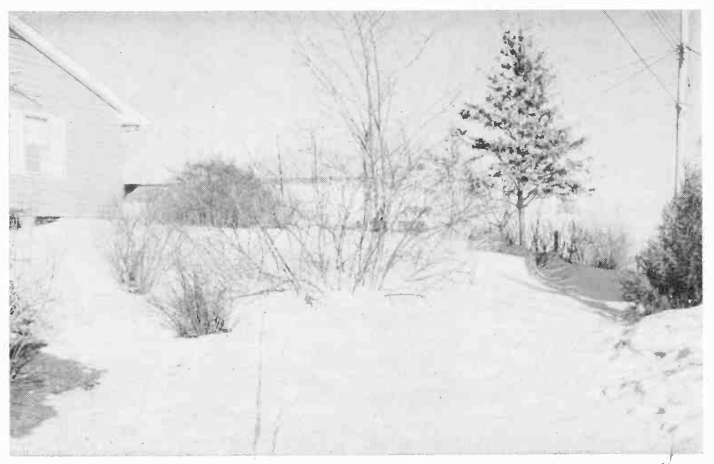
The KMA Guide