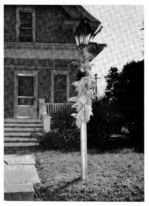
Promoting decorating lamp posts and mail boxes, Garden Club decorated Bernice's yard lamp in appreciation for help in publicizing civic projects.