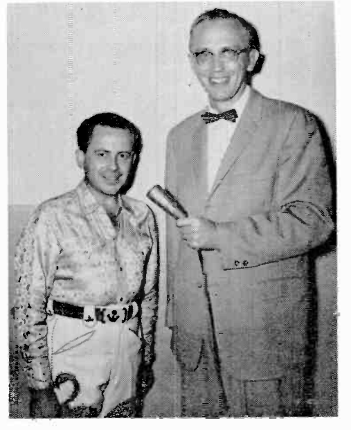
LITTLE JIMMIE DICKENS