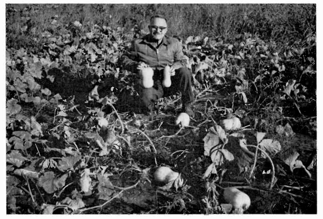
The KMA Guide