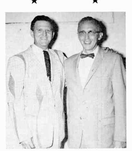
red sovine OCTOBER, 1961