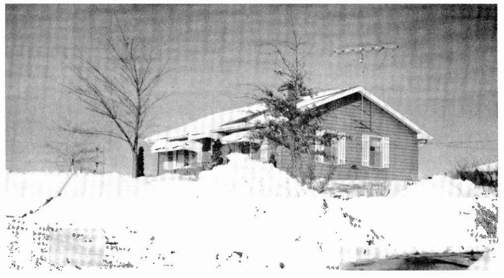
The KMA Guide