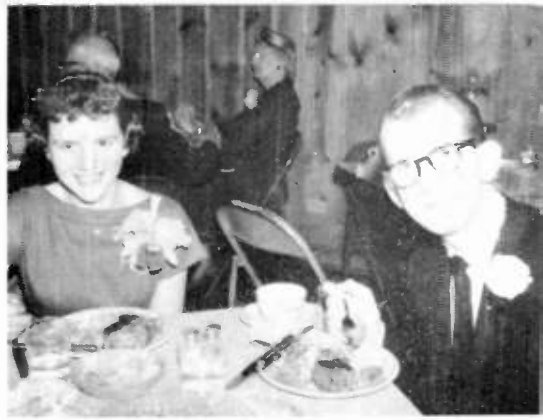
Please hurry with that picture so we can get back to these luscious steaks!