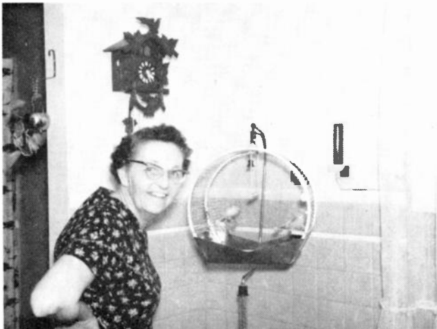
Archie, our new canary, spends sleepless night with mechanical "newcomer".

For many years we have had an imitation Cuckoo Clock hanging in the kitchen where it can be very plainly seen from all parts of the room. I say imitation because it never did have any Cuckoo in it — all it did was just tell time. Well! along about Christmas time it finally conked out and refused to run any more.