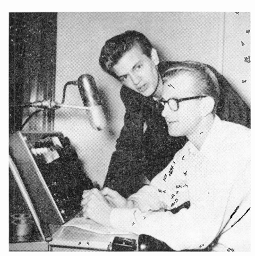
Tommy Burns and Phil Everly of "Bye Bye Love" fame discuss the famed brothers latest hit, "Wake Up, Little Susie" on the Tommy Burns show, heard each day from 1:30 until 4 o'clock.