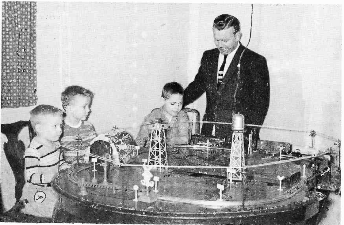
An electric train. . .and four fascinated Joes (enuff said.)