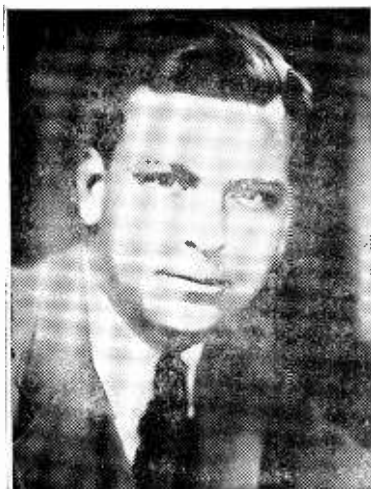
FULTON LEWIS, JR.

This is Fulton Lewis, Jr., who speaks to you direct from Washington, D. C. at 6 P.M. Mondays through Fridays, sponsored by your local Dannen Feed dealer.